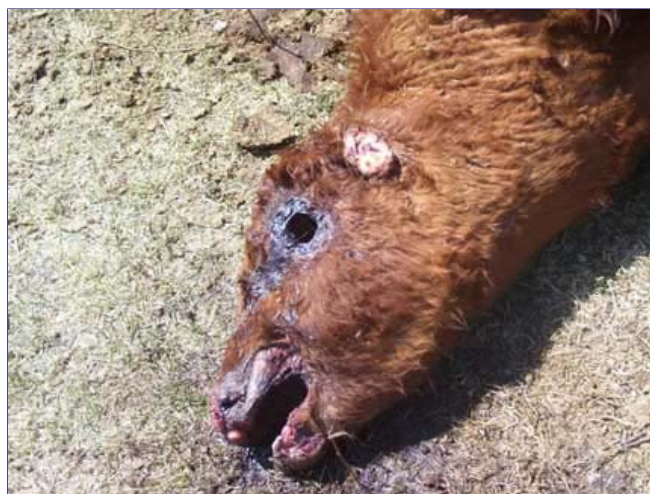
2-year-old pregnant cow's head: left ear was cut off; left eyeball removed and a circle of flesh around the eye; upper and lower lips, jaw flesh excised and tongue removed. Images of bloodless excisions from pregnant cow on the Heather and Edward Harris farm

Yes. There was no blood, no signs of blood.