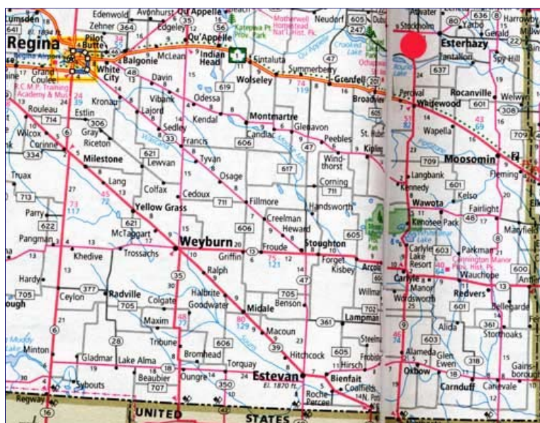
The red circle marks Stockholm near Esterhazy and the Manitoba, Canada, border east of Regina.

May 22, 2008 Stockholm, Saskatchewan, Canada - There has been yet another cattle mutilation in Saskatchewan, Canada, found on May 1, 2008. This time it's a 2-year-old pregnant cow on a farm about 5 miles from Stockholm, a ranching community of about 500 residents not far from Esterhazy and the Manitoba border. Straight west is the large Saskatchewan city of Regina.