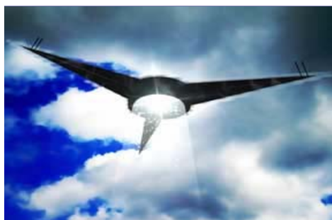
Computer 3-D recreation

"I don't know where the ring with the antenna appendages was from. I definitely do not believe it was manmade. There's a lot of stuff out there that I know can be manmade, but this was not. This was completely otherworldly." – Cincinnati Drone Eyewitness