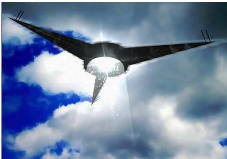
Computer 3-D recreation

to a point, I could not actually see its point.