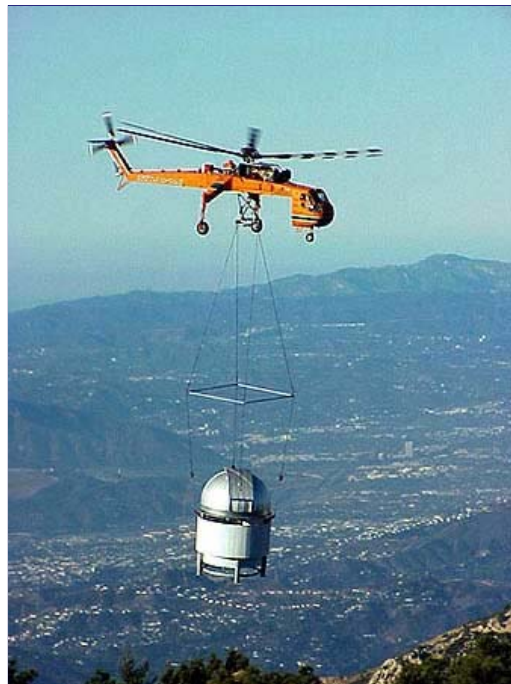
Skycrane hauling up interferometer housing at Mt. Wilson Observatory in Los Angeles, California, in 1998.

Anyway, that's when I heard the rotors going overhead. There were no lights, but I know what a skycrane sounds like and I know what it looks like.