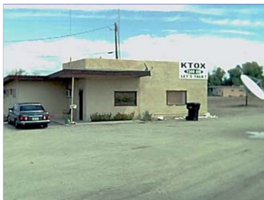
KTOX 1340 AM Radio, Needles, California.