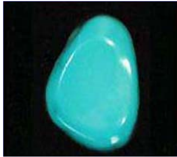
Arizona turquoise gemstone.

R. B.: "Never seen anything this dramatic come out of sky before. Have seen green-blue meteors, but this thing was bright, turquoise blue, almost like a lighter sky blue!