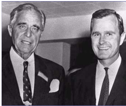
Prescott Bush and his son George H. W. Bush, the 41st American president from 1989 to 1993. Prescott Bush's grandson, George W. Bush, is 43rd U. S. president from 2001 to 2009.

Even current President George W. Bush's grandfather - Prescott Bush – was intimately connected in the 1930s to 1940s with the powers that represented the Rockefellers and Rothschild banking and business interests that were also involved in the creation and growth of Hitler and his Nazi Party. In late 1942, the U. S. government actually prosecuted Prescott Bush under the Trading With The Enemy Act because he was handling money for German steel magnate, Fritz Thyssen, who was helping to finance the rise of Adolph Hitler and the Nazi Third Reich.