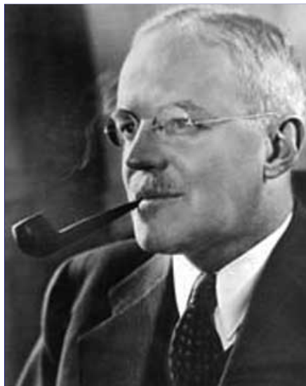
Allen Welsh Dulles (April 7, 1893 – January 29, 1969)

ISN'T IT TRUE THAT ALLEN DULLES, THEN DIRECTOR OF THE CENTRAL INTELLIGENCE AGENCY IN THE 1950S, ARRANGED TO HAVE THE NAZIS OF THE MUSLIM BROTHERHOOD TRANSFERRED TO SAUDI ARABIA?