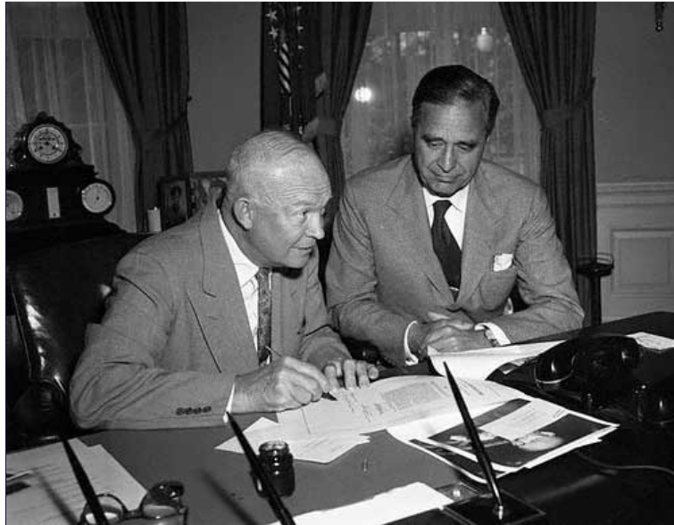
American President Dwight D. Eisenhower with Prescott Bush in Oval Office, White House. Prescott Sheldon Bush, May 15, 1895 to October 8, 1972, was a U. S. Senator from Connecticut, a Wall Street executive banker and founding partner with Brown Brothers Harriman and Director of Union Banking Corp., New York City. He was father of former U. S. President George H. W. Bush (41st) and the grandfather of U. S. President George W. Bush (43rd). In 1942, Prescott Bush was prosecuted under the Trading With The Enemy Act, found guilty of financial and propaganda support for Hitler and Nazis, was fined and stripped of his holdings in the Union-Banking Corp.

PRESCOTT BUSH, THE GRANDFATHER OF THE CURRENT PRESIDENT OF THE UNITED STATES (43rd) AND FATHER OF THE FORMER PRESIDENT BUSH (41st) – COULD YOU PLEASE EXPLAIN PRESCOTT BUSH’S ROLE IN AMERICAN BUSINESS, POLITICS AND MONEY IN RELATIONSHIP TO NAZI GERMANY?