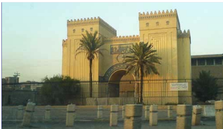
Iraq National Museum, holder of 5,000-year-old treasures and artifacts from the time of Mesopotamia onward, was attacked and looted soon after the United States invaded Baghdad in March 2003. TV news reported American troops were also going underground to search thirty miles of tunnels beneath Baghdad for "weapons of mass destruction."

Museum looting for General Tommy Franks, he described the looting of the basement as an 'inside job.' He said there were guards conveniently missing; they had keys to some of the locked vaults; they knew exactly what they were looking for; they by-passed expensive looking fakes. They went right for the new, uncatalogued stuff.