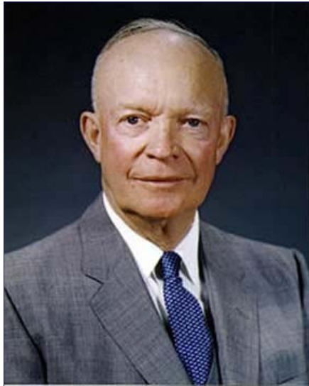
34th President of the United States, in office from January 20, 1953, to January 20, 1961. His Director of Central Intelligence Agency was Allen Welsh Dulles. May 29, 1959