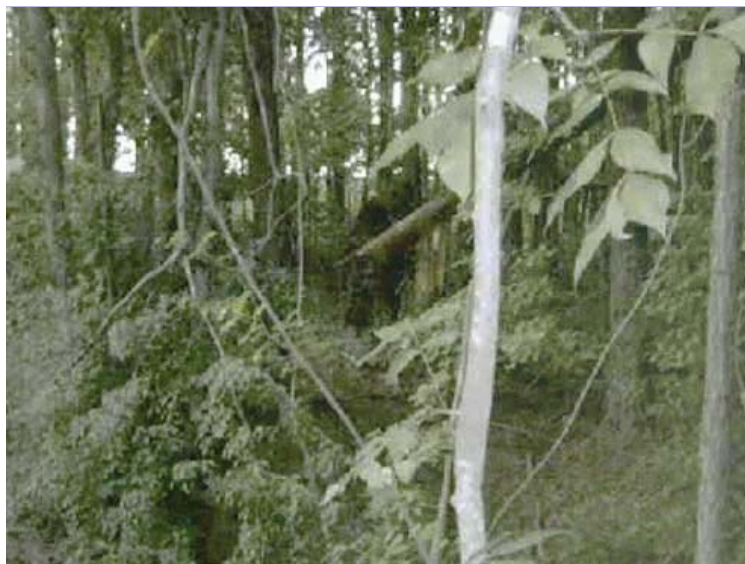
This video frame shows dark figure at center, which Dyer and Whitton claims to be one of three living Bigfoot or Sasquatch creatures they saw in an undisclosed area of a northern Georgia forest on June 10, 2008.

Tom Biscardi also held up a photograph encased in plastic showing a close-up of the creature's head and teeth, which are very even and light in color with no apparent incisors. Another photograph he showed was of a woods in which there is a large, dark-colored biped figure in the background.