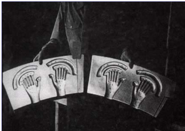
Panels with depressions of six-fingered hand prints allegedly found with the six-fingered humanoids in May 31 to June 2, 1947, recovery operation at crash site southwest of Socorro, New Mexico. Photograph from 16mm film © 1996 by Orbital Media Ltd.

[ See More Information at end of this report.]