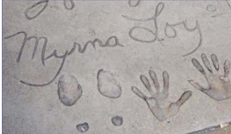
Myrna Loy's 1936 hand prints in wet cement outside Grauman's Chinese Theater, Hollywood, California.

engineered beings biologically manufactured especially for flight or long-term exploration - had to be calibrated to the headband. ...I could see how directional instructions could have been translated by the headbands into some form of current flowing through the skins and into the series of raised deck panels where there were indentations for the creatures' hands. The indentations on these panels, as the Roswell field reports described them, looked like the hand prints pressed into the concrete at the old Grauman's Chinese Theater in Hollywood. Were the directional commands a series of electronic instructions transmitted directly from the creatures' brains along their bodies and through the panels into the ship itself as if the ship were only an extension of the creature's body?"