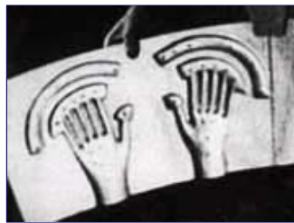
Panels with depressions of six-fingered hand prints allegedly found with six-fingered humanoids in May 31 to June 2, 1947, recovery operation at crash site southwest of Socorro, New Mexico.