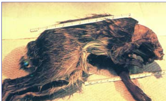
Headless rabbit found at Sound Beach, Long Island, New York, on April 21, 1990.