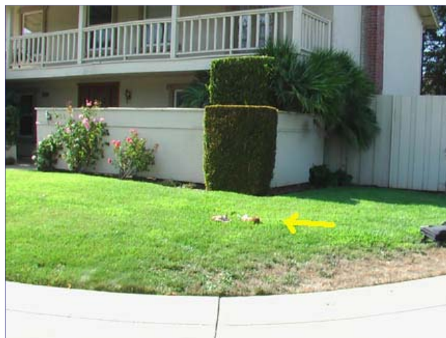
Yellow arrow points at cat cut in half, discovered in front yard of south San Jose, California, home, on August 16, 2005, about 4:00 PM.

Six years later, on August 16, 2005, a cat was discovered cut cleanly in half on the front yard of a south an Jose, California, resident.