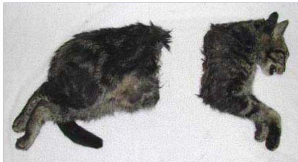
Above: August 2003, Bothel, Washington, first mutilated male cat found first week of August. Dr. Cherie Good, D.V.M., laid cat out to show the correct width of severed and removed middle section of the cat. Below: X-ray of the same cat showing the dark space in the back half that indicates all internal organs there have been removed. See: 091203 Earthfiles.