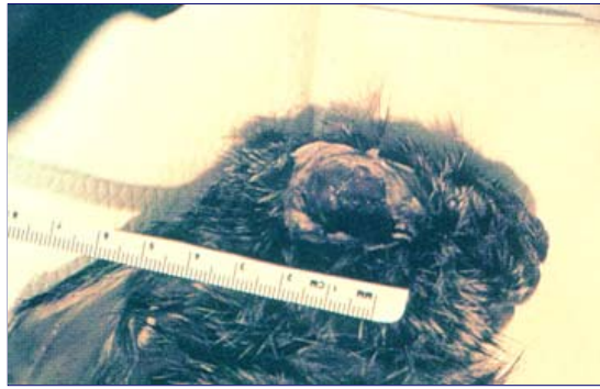
Second rabbit found a few hundred feet from first rabbit with right eye and surrounding eye tissue removed at Sound Beach, Long Island, New York, on April 21, 1990.