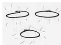
Left: “Boomerang” version of mysterious aerial object that morphed into middle pink-colored disc. Right: The pink disc then flashed three oval, white lights on its bottom surface and “little squares of light” dropped like snow onto apartment yard and privet bush. Half a dozen sightings April through July 2008, Levittown, Pennsylvania. Image and drawings by resident and eyewitness.