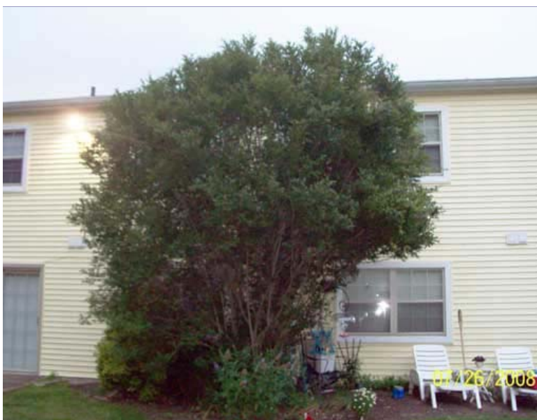
Privet bush about 15 feet high grows next to eyewitness's apartment back door in Levittown, Pennsylvania, where “little squares of light” first fell on June 12, 2008 - and two more times in July 2008 - from a pink-colored aerial disc and surrounded the privet bush and a silver maple tree about 65 feet away.