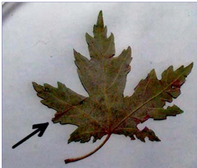
Arrow points to unusual reddish, thin, straight line on one of the sampled silver maple leaves exposed to the Levittown aerial object's glittery light energy.

I also want to point out there was another extremely unusual lesion that was very precisely exposed on the leaf. It was a line just like you would take a ballpoint pen with a ruler and draw a line with the ruler and pen across the leaf. The width of that line – what I'm calling an 'energy beam' trace – was only 1/10th of one millimeter wide.