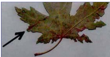
Arrow points to unusual reddish, thin, straight line on one of the sampled silver maple leaves exposed to the Levittown aerial object's glittery light energy.

“This seems to be physical evidence of very thin energy beams only 1/10th of a millimeter wide, probably of a microwave nature, that caused these straight line lesions in the leaves. ... I've never seen anything like this before.” - Biophysicist W. C. Levengood