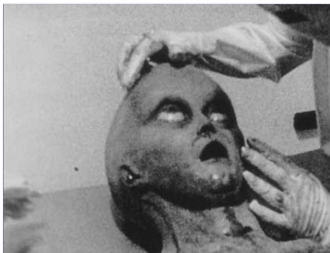
Large whites of eyes are revealed after the surgeon lifted off black lenses in Santilli version of non-human autopsy film.

WERE THE EYES OPEN OR CLOSED AS THEY LAY THERE ON THE PALLETS?