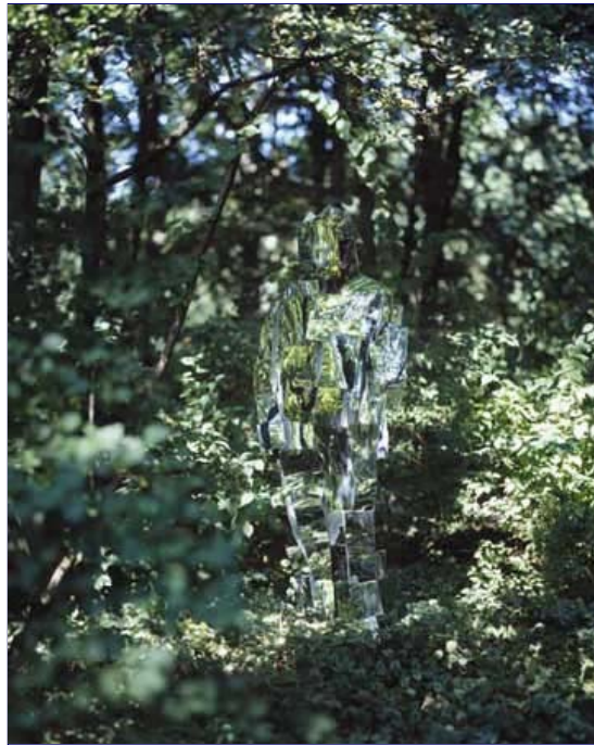
The predator extraterrestrial in the Schwarzenegger movie was nearly see-through-invisible when not moving.