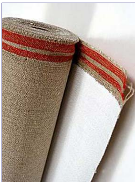
Texture on canvas roll.

FROM YOUR CLOSE-UP VIEW, WAS THE AREA 51 GREY BEING’S SKIN TEXTURED? SOME ABDUCTEES COMPARE SKIN THEY HAVE SEEN TO CANVAS.