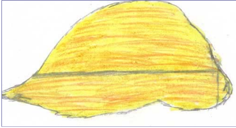
Sarah: "This sketch is what the 3-D pod looked like to me. I did have a strange feeling all the time that it was in the sky. The feelings disappeared after the craft was out of sight." Sketch © 2008 by Sarah.

HOW FAR DO YOU THINK YOU WERE FROM THAT RISING COCOON OR POD IN RELATIONSHIP TO WHERE TIM COMSTOCK WAS?