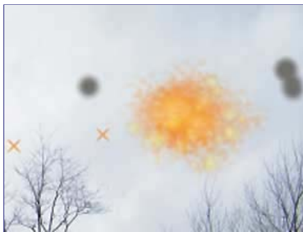
2:33 AM Eastern, November 2, 2008, glowing “pod” rose upward and disappeared with triangle of lights near Midvale, Ohio, home. Dark circles show position in daylight photo where lights were in night sky as glowing, orange-yellow object moved upward. Photograph and graphic illustration © 2008 by “Joy.”