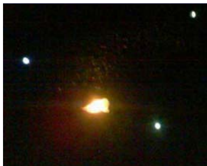
Cell phone image around 3:48 AM Eastern, October 23, 2008, on Route 7 near W. H. Sammis coal power plant between Empire and Stratton, Ohio, along Ohio River.