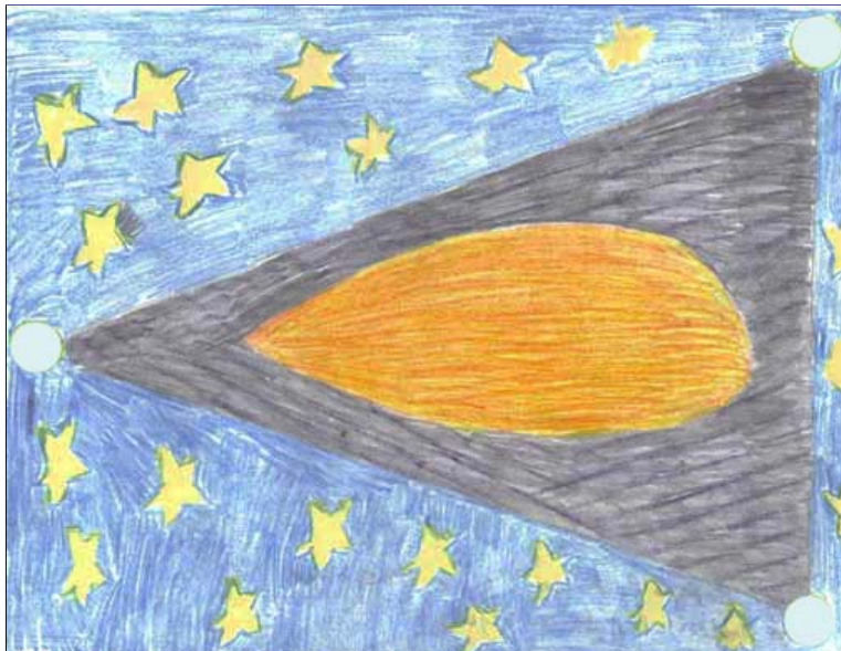
Sarah: "This is a sketch of the triangular craft's bottom surface between the three circular lights I could see as the glowing pod was getting closer to it. The bottom was like a mix of charcoal grey and black in color. The texture looked almost like burnt, crumpled foil that someone had tried to straighten out. It was one of the strangest sights I have ever seen." Sketch © 2008 by Sarah.

The bottom of it almost looked like if you were looking at the bottom of a boat – like it's an oval, but has a ridge through the middle of it. It kind of looked like that and then was kind of squared off further up. From the way I was looking at it, it almost looked like a bright, yellowish-orange in color.