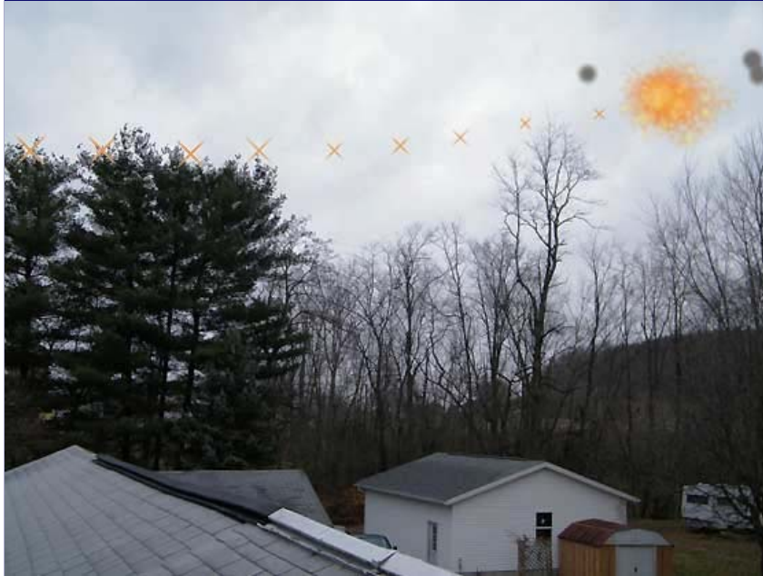
“Pod” continued left to right along tree line and up and disappeared with triangular pattern of lights at approximately 2:33 AM Eastern, November 2, 2008, near Midvale, Ohio, home. Dark circles show position in daylight photo where lights were in night sky as glowing, orange-yellow object moved upward. Photograph and graphic illustration © 2008 by “Joy.”

After the glowing thing reached the triangle, from the angle it was at I could not see any reflections, but right way I called a friend who lives on the next road over and asked her if anything was going on there. She said there was something behind her house approximately over the wooded area that’s right behind the first road in town.