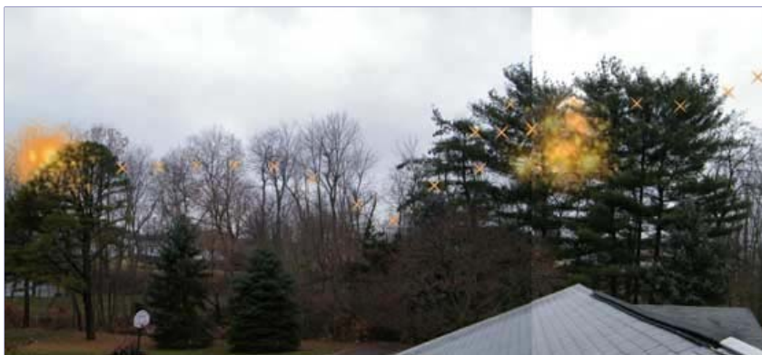
Moving left to right, the glowing “orb” or “pod,” moved horizontally along tree line before moving upward (far right) and into triangle of lights higher in the sky. Photo and graphic illustration © 2008 by Joy.

It moved horizontally and it was changing shape, but it wasn’t like going up or down. It was just following a straight line through the tree line. Then, it dipped down behind the trees and when it did that, I could see the silhouette of the trees in front of it, but I could not see the trees behind it, as if it were solid.