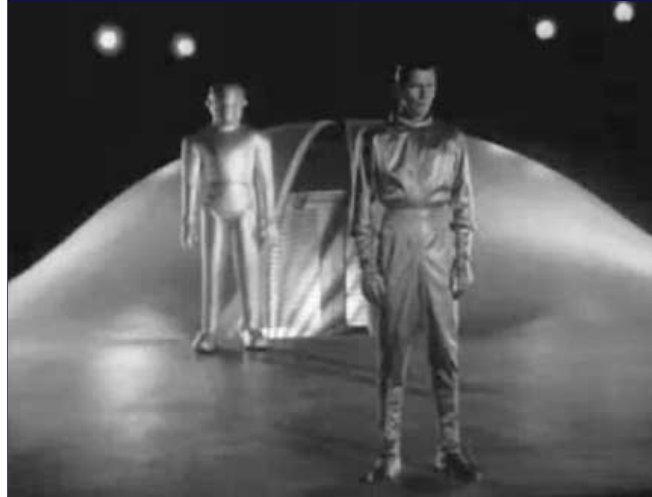
1951 science fiction film, The Day The Earth Stood Still , about an extraterrestrial humanoid and robot on diplomatic mission to Earth.

Back in 1983, I was in the script development phase of producing an hour special documentary for Home Box Office with the working title UFOs: The E. T. Factor . During research, I was told by an intelligence source that the funding and script inspiration for The Day the Earth Stood Still were actually provided by the Central Intelligence Agency behind-the-scenes in order to test the public's reaction to extraterrestrials that came in organic form and robotic form and could cause large scale electrical blackouts.