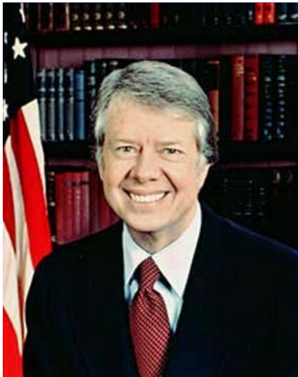
Jimmy Carter, 39th American President, 1977-1981.

- Jimmy Carter, 1976 Presidential Campaign comments to reporters