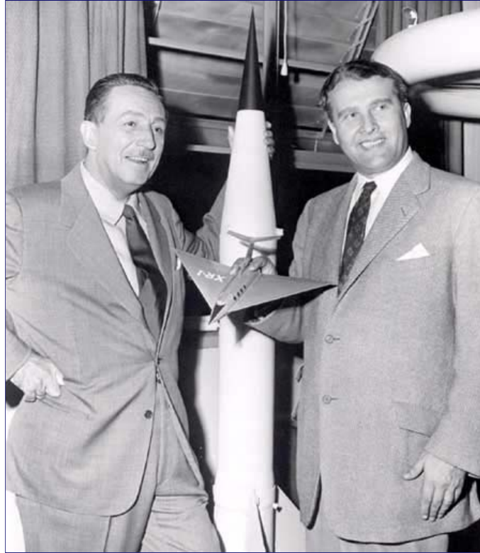
1954, Walt Disney holding on to V-2 rocket model while Dr. Werhner von Braun holds model of XR-1 plane. Dr. von Braun was then Chief of the Guided Missile Development Operation Division at the U. S. Army's Ballistic Missile Agency in Redstone Arsenal, Alabama. In the 1950s, Dr. von Braun worked with the Disney Studio as a technical director on three films about space exploration for television. Man in Space aired on ABC-TV, March 9, 1955; Man and the Moon also aired in 1955; Mars and Beyond was televised on December 4, 1957.