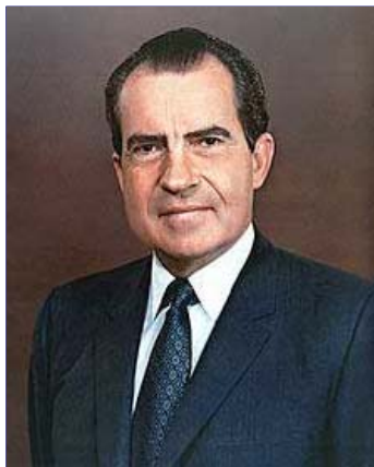
Richard Milhous Nixon, V. Pres. for 34th President, Dwight D. Eisenhower, and 37th American President, January 20, 1969 – August 9, 1974.

Nixon looked at the door and said, 'That's a good idea. Good thinking.' But I was trying to tease him like the other guys! All through his career, the CIA always hassled him about somebody being out to get him. It was our big inside joke.