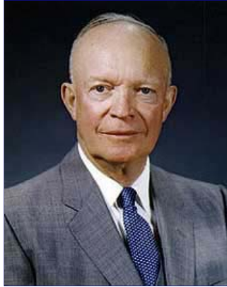
Dwight David Eisenhower, 34th American President, January 20, 1953 – January 20, 1961.

Eisenhower was very hard nose military. There was no joking with him. Everything was absolutely cut and dried and you kind of hoped to get out of his office as soon as you could.