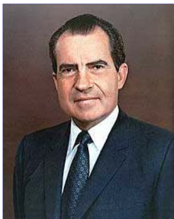
Richard Milhous Nixon, V. Pres. for 34th President, Dwight D. Eisenhower, January 20, 1953 – January 20, 1961; and 37th American President, January 20, 1969 – August 9, 1974.