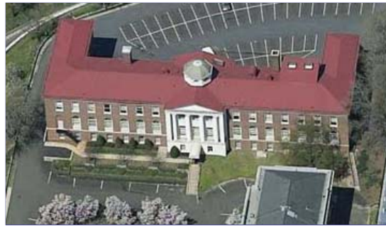
The Office of Strategic Services (OSS) occupied this 2430 E Street N. W. building in Washington, D. C., during World War II. With the creation of the post-war Central Intelligence Agency (CIA) on September 18, 1947, the CIA moved into the OSS building.

As the CIA grew, it spread into three dozen CIA offices scattered around the nation's capitol. On August 4, 1955, President Dwight D. Eisenhower signed a bill authorizing $46 million for construction of a CIA headquarters building. On November 3, 1959, the cornerstone and time capsule were placed in the new Langley, Virginia, CIA headquarters. ]