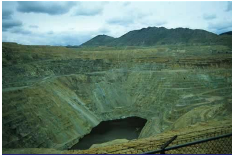
Anaconda Copper open pit mining operations began in July 1955, near Butte, Montana.

superseded underground operations because it was far more economical and much less dangerous than underground mining.