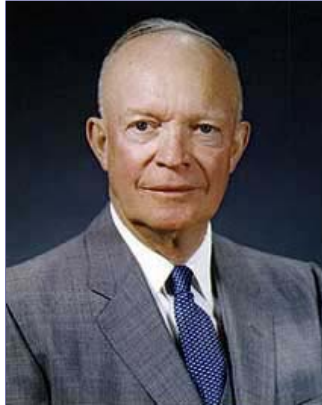
Dwight David Eisenhower, 1st Supreme Allied Commander Europe and 34th American President, January 20, 1953 – January 20, 1961.

Then the third and last meeting in which I participated, it was with both Eisenhower and Nixon in the spring of 1959. In that meeting, nothing was said about our trip to Area 51. We only covered current UFO issues with President Eisenhower for about a half-hour."