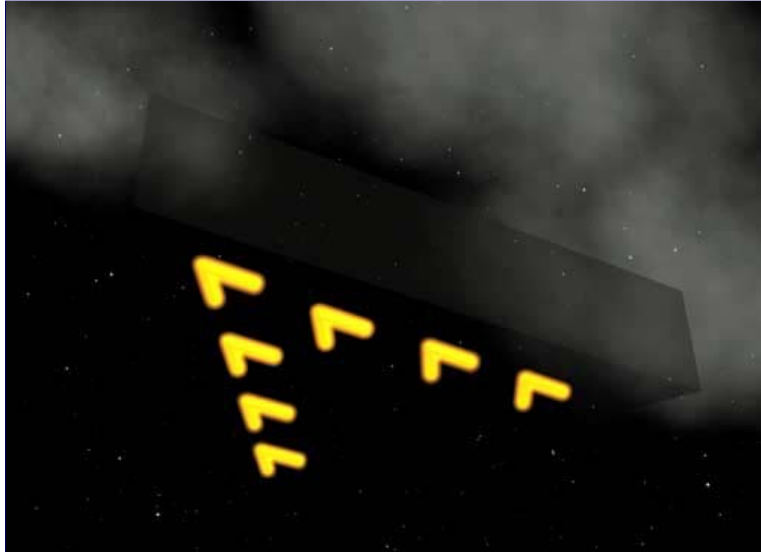
Large V-shaped aircraft, longer than a football field, an estimated two stories high and camouflaged with starry field in thin clouds around 12:30 AM Eastern on August 16, 1987, near Cape Canaveral, Florida. Computer illustration © 2009 by Paul Kirsch .

IT'S A GREAT CAMOUFLAGE IF IT IS SOLID AND USING SOME TECHNOLOGY METHOD TO CAMOUFLAGE ITSELF AS A STARRY NIGHT.