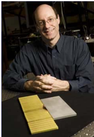
David R. Smith, Ph.D., William Bevan Prof. of Electrical and Computer Engineering at Duke University with new cloaking device, which measures 20 inches by 4 inches and is less than an inch high. It is made of more than 10,000 individual pieces arranged in parallel rows per unique algorithms. Of those pieces, more than 6,000 are unique. Each is the same fiberglass material used in circuit boards and etched with copper. 2009

Cloaking devices bend electromagnetic waves, such as light, in such a way that it appears as if the cloaked object is not there. In the latest laboratory experiments, a beam of microwaves aimed through the cloaking device at a ‘bump’ on a flat mirror surface bounced off the surface at the same angle as if the bump were not present.