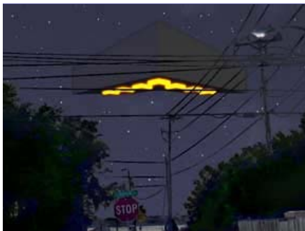
Large V-shaped aircraft, longer than a football field and an estimated two stories high, on Plumosa Street by the Indian River west of Cape Canaveral, Florida, around 12:30 AM Eastern on August 16, 1987. Computer illustration © 2009 by Paul Kirsch.