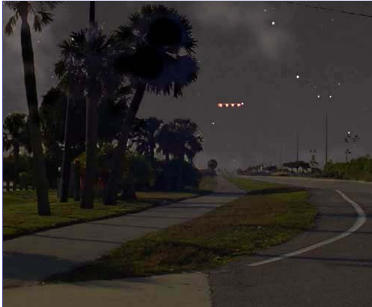
Computer illustration © 2009 by Paul Kirsch.

Maybe about ten miles. As we're coming up over the bridge that connects Cocoa Beach and Merritt Island, we noticed in the horizon to the west it looked like four stars in a constellation. I had never seen that before and as we drove towards the 'constellation,' it came up over the car. It was the same V-craft.