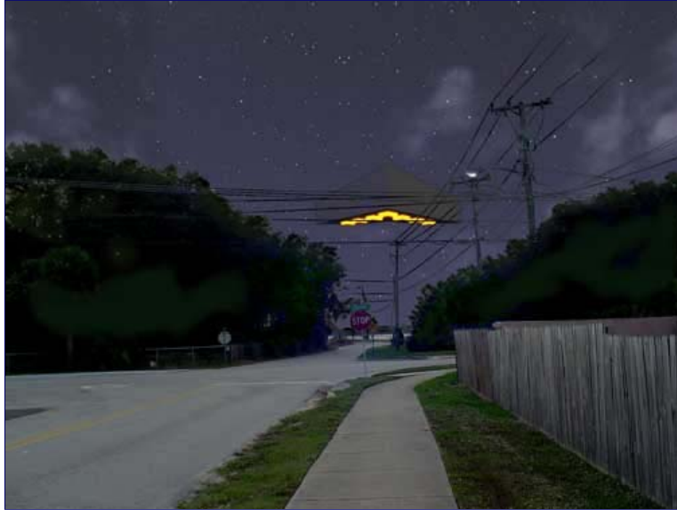
Large V-shaped craft stopped in flight, turned silently 180 degrees to face the teenagers in the car at Plumosa Street by the Indian River west of Cape Canaveral, Florida, around 12:30 AM Eastern, August 16, 1987. Computer illustration © 2009 by Paul Kirsch.

When we stopped our car, the huge V-shaped aircraft stopped, too, and then turned from the direction it was going – which was to the west – it turned back and was facing towards the east looking right at us.