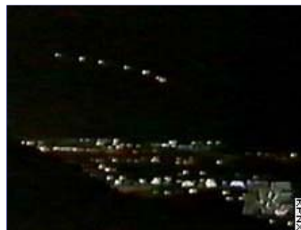
Arc of Phoenix lights videotaped by KPNX-TV, NBC-Channel 12, around 10 PM Pacific, on March 13, 1997. Earlier in the evening between 7 PM and 8 PM, several eyewitnesses reported a triangle-shaped craft about two miles long.