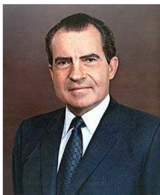
Left: Dwight David Eisenhower, 1st Supreme Allied Commander Europe and 34th American President. Right: Richard Milhous Nixon, V. Pres. for 34th President, Dwight D. Eisenhower, January 20, 1953 – January 20, 1961; and 37th American President, January 20, 1969 – August 9, 1974.