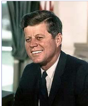
John Fitzgerald "Jack" Kennedy, 35th President of the United States, January 20, 1961, to November 22, 1963, when assassinated in Dallas, Texas.