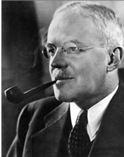
Allen Welsh Dulles (April 7, 1893 – January 29, 1969), first civilian Director of the Central Intelligence Agency following Gen. Walter Bedell Smith, from February 26, 1953, to November 29, 1961, under Presidents Dwight D. Eisenhower and John F. Kennedy.

During the 1930s, Allen Dulles gained much experience in Germany. An early foe of Adolf Hitler, Dulles was transferred from Britain to Berne Switzerland during WWII where he became the Office of Strategic Services (OSS) station chief, the precursor to the CIA. Dulles spied on Nazi Germany plans and activities. Dulles established wide contacts with German émigrés, resistance figures, and anti-Nazi intelligence officers who gave him reports on developments in Germany, including accurate warnings about plans for Hitler's V-1 and V-2 missiles.