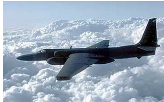
The Lockheed U-2R/TR-1 took its first high altitude flight on August 1, 1955.

I think it was a U-2 photo at that time in June 1959.