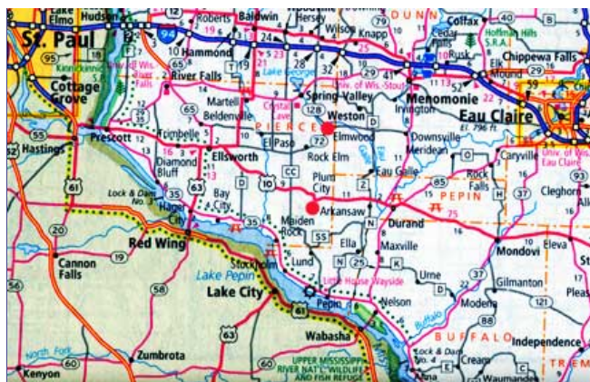
Between St. Paul on the west and Eau Claire on the east is Elmwood, Wisconsin, north of rural Plum City. (Elmwood is top red circle on map north of Plum City red circle).