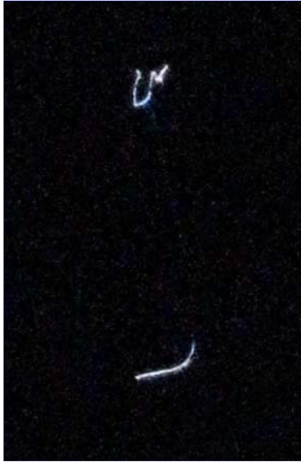
February 15, 2009, Camera On Tripod