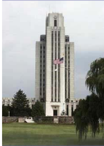
Bethesda Naval Hospital, Bethesda, Maryland.

“At around 2 a.m. on the morning of May 22, 1949, America’s first Secretary of Defense, James Vincent Forrestal, fell to his death from a small window of the 16th floor of the Bethesda Naval Hospital.