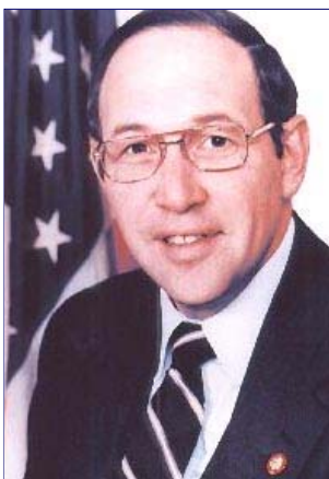
Cong. Steve Schiff (R) Albuquerque, NM 1st Congressional District. Died March 25, 1998, at age 51, from skin cancer.

[ Editor’s Note: Earthfiles December 4, 2004 - “In 1993, New Mexico Congressman Steve Schiff asked the Government Accounting Office (GAO) to determine if the U.S. Air Force, or any other U.S. government agency, possessed information on the alleged crash and recovery of an extraterrestrial vehicle and its alien occupants near Roswell, New Mexico in July 1947.