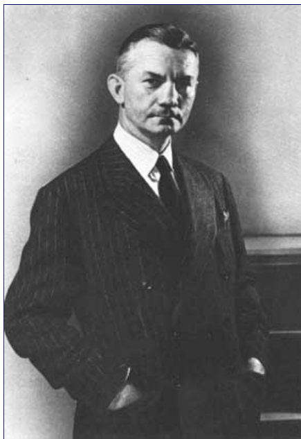
James Vincent Forrestal (February 15, 1892 – May 22, 1949) was a United States Secretary of the Navy and the first U.S. Secretary of Defense from September 17, 1947, to March 28, 1949.