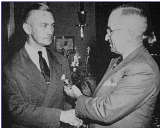
First Secretary of Defense James V. Forrestal from September 17, 1947, to March 28, 1949, with U. S. President Harry S. Truman, undated.