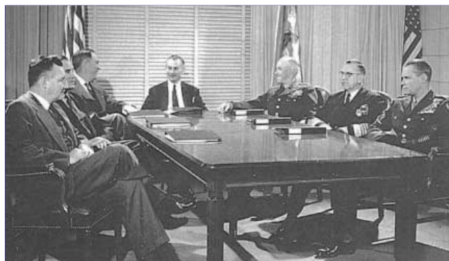
Secretary of Defense James Forrestal's last meeting, March 25, 1949.

Among those present were left to right: Under Secretary of Navy W. J. Kenney; Secretary of Air Force W. Stuart Symington; Secretary of Army Kenneth C. Royall; James Forrestal, Secretary of Defense; General Omar Bradley; Admiral Louis Denfield; and General Hoyt S. Vandenberg. Shortly after this photograph, Forrestal resigned.