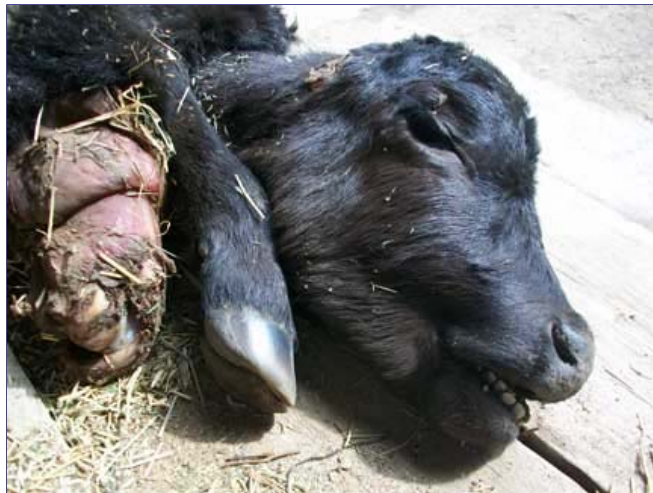
1-week-old calf's head, one of the front legs and unidentified tissue.

The head is there connected to neck bones, two front legs and spine. All the abdomen and internal organs were gone. Then at the bottom of the spine and broken pelvis, two back legs and tail look relatively normal, but hung only by thin hide.