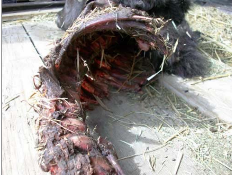
Empty mediastinum and ribs of 1-week-old male calf found next to the feed bin at the River Valley Ranch owned and operated by Tom Miller since the early 1960s.