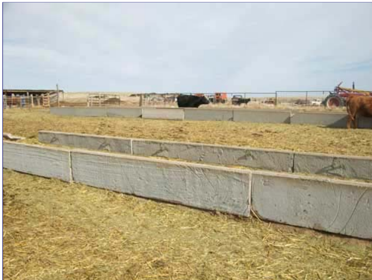
Feed bin where 1-week-old male calf was found dead and mutilated on Tuesday morning, March 17, 2009.

I think so because the mother was standing just at the spot where the calf had been.”