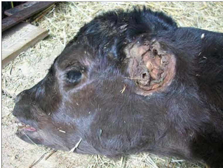
One-week-old male calf had both eyes and tongue intact, but both ears had been cut off at the skull in hardened, plasticized tissue that in previous mutilation cases is characteristic of excision by heat.

Further, both ears were cut off at the skull, leaving circular patterns of hardened skin. Both eyes and the tongue remained, which is also unusual, since the majority of animal mutilations include the removal of at least one ear and one eye along with the removal of the tongue and jaw flesh.