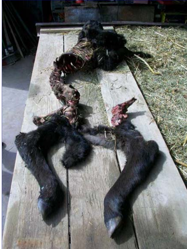
On Tuesday morning, March 17, rancher Tom Miller picked up the strangely mutilated, bloodless carcass of a 1-week-old male calf from beside the feed bin and placed what was left of the body on his flatbed truck, shown above.

The head is there connected to neck bones, two front legs and spine. All the abdomen and internal organs were gone. Then at the bottom of the spine and broken pelvis, two back legs and tail look relatively normal, but hung only by thin hide.