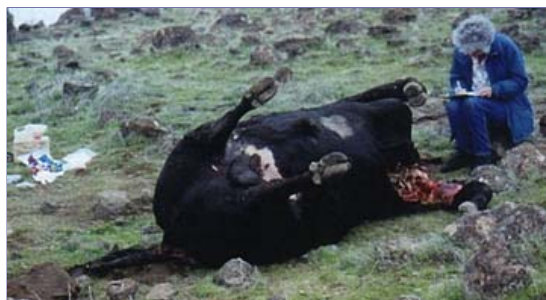
Dead and mutilated 2,000-pound bull discovered January 17, 1997, by owners Jean and Bill Barton on their winter ranch near Red Bluff, California. Investigator Jean Bilodeaux collected tissue, grass and soil samples, including unusual hardened dark particles from bull's testicles and chest near excision that

Another significant forensic discovery was in January 1997 when field researcher Jean Bilodeaux from Oregon joined us to investigate a dead and mutilated bull in Red Bluff, California. [ See 3-part 101500Earthfiles ] Jean found hardened, dark particles on a mutilated bull's testicles and chest that proved to be pure bovine hemoglobin. Significantly, four years later, we found pure bovine hemoglobin particles on two more mutilated cattle. They were 2001 cases in Alabama and Canada. Pure hemoglobin can only be produced by two centrifuge processes in laboratories, not in remote pastures.