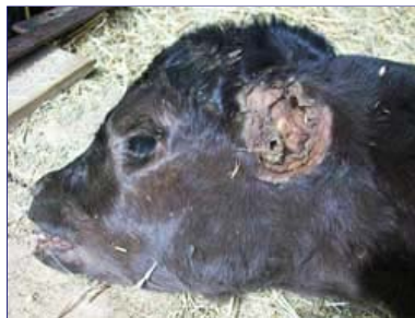
1-week-old male calf discovered by Hoehne, Colorado, rancher Tom Miller on March 17, 2009, with both ears removed as if exposed to heat, its abdomen and all internal organs removed and pelvis broken as if dropped to the ground from some height.

DID YOU TOUCH THAT TISSUE TO SEE WHAT IT FELT LIKE?