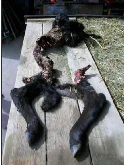
On Tuesday morning, March 17, 2009, rancher Tom Miller picked up the strangely mutilated, bloodless carcass of his 1-week-old male calf from beside the feed bin and placed what was left of the body on his flatbed truck, shown above.

Something you would expect to see in a horror flick where something comes in and just rips you apart. But, there was no blood splattered anywhere on the hair near the areas that were ripped or cut off the calf.