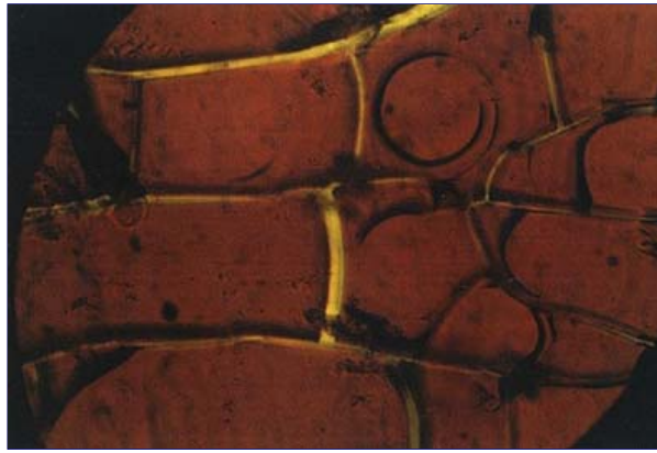
Dehydrated fragment from black particles found on chest hide of mutilated bull discovered in Red Bluff, California, January 17, 1997. This photomicrograph (450x) shows uninterrupted “mud crack”-type patterns and no indication of cellular structures such as erythrocytes and leukocytes. Analytical chemistry analysis determined this is pure bovine hemoglobin. Photomicrograph © 2000 by W. C. Levengood, Biophysicist.

proved to be pure hemoglobin. Photograph on January 18, 1997 © by Jean Barton.