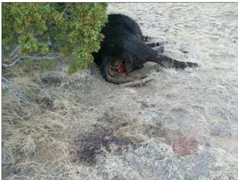
Foreground disturbance after coyote ate rectal and vaginal tissues out between Saturday night, March 21, 2009, and Sunday morning, March 22, 2009, by 9:30 AM.

We went back out there on Sunday, March 22, 2009, about 9:30 AM, and the right eye was still intact (cow was laying on left side with right side of face skyward). That tells me crows never got on her. But, a coyote had eaten out her rectum. So, there was a pretty good hole in there on Sunday. It was not there on the first photographs that we took on Saturday, the rectal skin had not been broken.