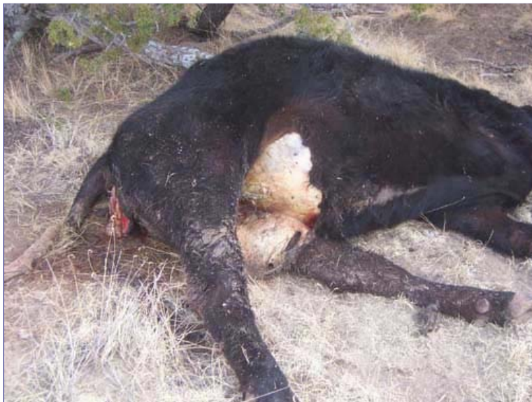
2.5-year-old English Angus and French Gelbvieh heifer crossbreed as she was found beneath a juniper tree with udder bloodlessly removed, vaginal tissues reddened and expanded from having given birth earlier Friday night, March 20, 2009, to male calf. Image Saturday morning, March 21, 2009

Around where the udder had been removed, I could find no traces of blood at all. The cuts were just perfect. They were bigger than the actual udder would have been and they just cut the hide and pulled the udder out. What is left is just some tallow – she was a good, fat heifer – and some raw meat (muscle). But none of that has been cut! Her stomach had never been torn open. Her rectum had not been torn open.