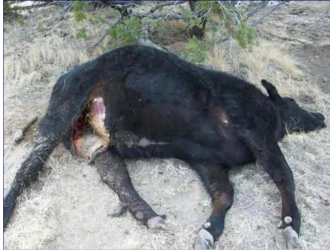
2.5-year-old English Angus and French Gelbvieh heifer crossbreed gave birth to calf Friday, March 20, 2009, and was found dead with udder removed without blood or milk fluids visible next morning, in Walsenburg, Colorado. Image Sunday morning, March 22, 2009.