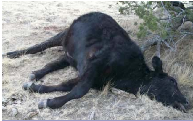
Tongue, eyes and ears intact on 2.5-year-old English Angus and French Gelbvieh heifer crossbreed. Image Sunday morning, March 22, 2009

Her head – I could not find any signs of trauma, which you would look for if a lion had killed her or something like that. I could not see where her feet had moved the ground in any fashion. She was laying on her left side and her feet/legs were sticking straight out front and back. Under a normal tranquilization or attack, a cow will move her feet before she goes under. Nothing! I could not see any sign she ever moved her feet at all.