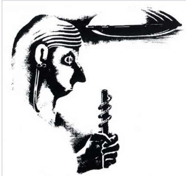
Rod communicator with coils on top was depicted as being in the left hand of a large-nosed alien being who allegedly landed at Holloman AFB in New Mexico, on April 25, 1964, aboard an egg-shaped craft for a meeting with American military and at least one scientist.

minds is as variable as the human mind receivers. According to Ebe, in his civilization telepathic communication is instantaneous and the same for all. In illustration below, the long "earrings" were actually described as "silk threads" that came down from head covering near ears that were described as antennae for communicating back to egg-shaped craft one of which landed at Holloman AFB in Alamogordo, New Mexico, on April 25, 1964, I was told, while two other egg-shaped craft hovered defensively or offensively in the air above the landed craft from which a Sumerian-type being with huge beaked nose, reptilian eyes and ropey headdress emerged along with two grey-skinned beings. The large-nosed being carried a rod in its left hand that had a coil at the top used for telepathic communication with the humans at the scene.