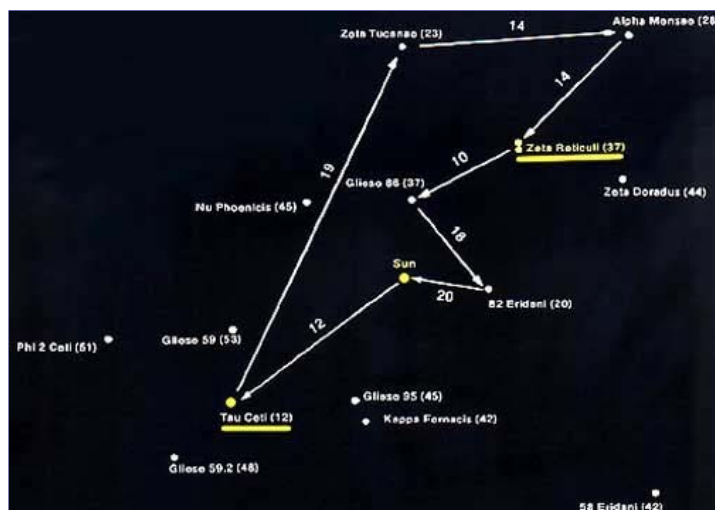
Sixteen stars, including our Sun, are all similar Spectral Class G, which could support life. Our Sun is at the edge of the group with 82 Eridani, Gliese 86 and Zeta Reticuli (binary) near the central region. The arrows indicate the distance in light-years between suns. The numbers in parentheses indicate distance from our Sun. Map from Astronomy , December 1974.

According to Ebe, his planet in the Zeta Reticuli binary system has various degrees of brightness without total darkness. The Eben eyes are supposed to have a bright yellow iris that is vertical like a cat or reptile with three lids that provide variable thickness over the eyes, depending upon brightness of light. Supposedly one pair of lids moves across the eyes horizontally, not vertically as human lids open and shut.