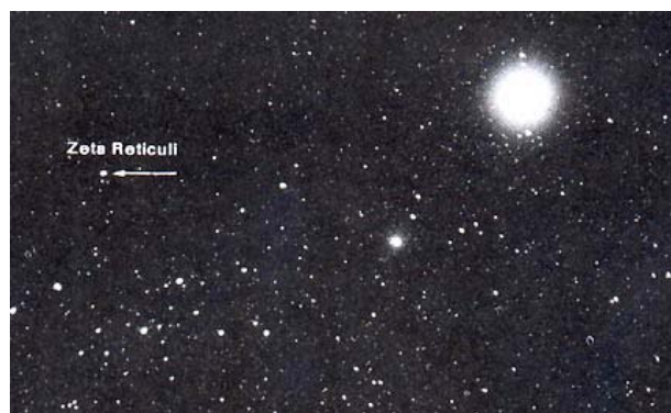
Above: Wide view of Zeta Reticuli I and II binary star system 39.41 light-years from Earth. Zeta Reticuli 1 is a G 3/5 V Spectral Type sun and Zeta Reticuli 2 is a G2 V Spectral Type. Below: Close-up of the binary stars.

[ See in Archive: 120705 Earthfiles - "Zeta Reticuli I and II - Binary Home of Extraterrestrial Biological Entities (EBEs or EBENS)?"