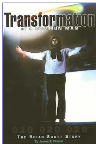
Transformation of A Common Man: