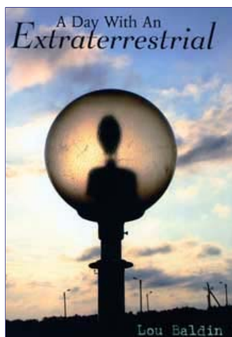
A Day With An Extraterrestrial

Military insiders and people in the human abduction syndrome reference large city-sized, EBEN space stations orbiting between Saturn and Uranus and/or Uranus and Neptune. Back in the 1950s, there were at least two large, "mother ships" orbiting Earth. Author and abductee experiencer, Lou Baldin, described details about a huge, complex space city orbiting near Uranus in his second book published in 2008 entitled, A Day With An Extraterrestrial . His first book, In League With A UFO © 1997, has important insights into alien technologies, cloning and genetic manipulation of bodies that look human, but are designed for alien control and monitoring.