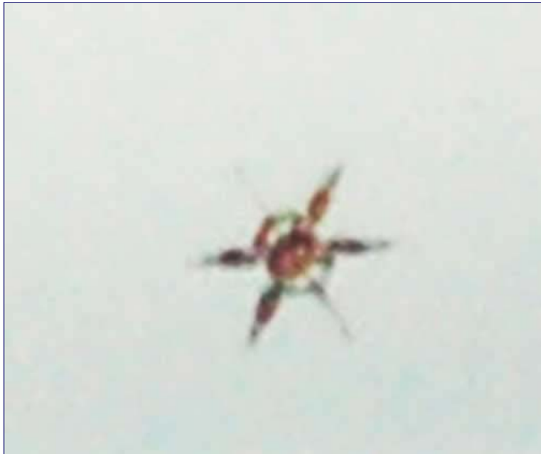
Above images cropped and enlarged in Photoshop with Ruud Schmidt's permission from his thirteen original digital images taken around 1:30 PM to 1:35 PM on Saturday, September 8, 2007, in Petten, Holland, campground.

“YOU SAW IT AS A DARK OBJECT IN THE SKY. DID YOU KEEP WATCHING IT UNTIL - WHAT HAPPENED?