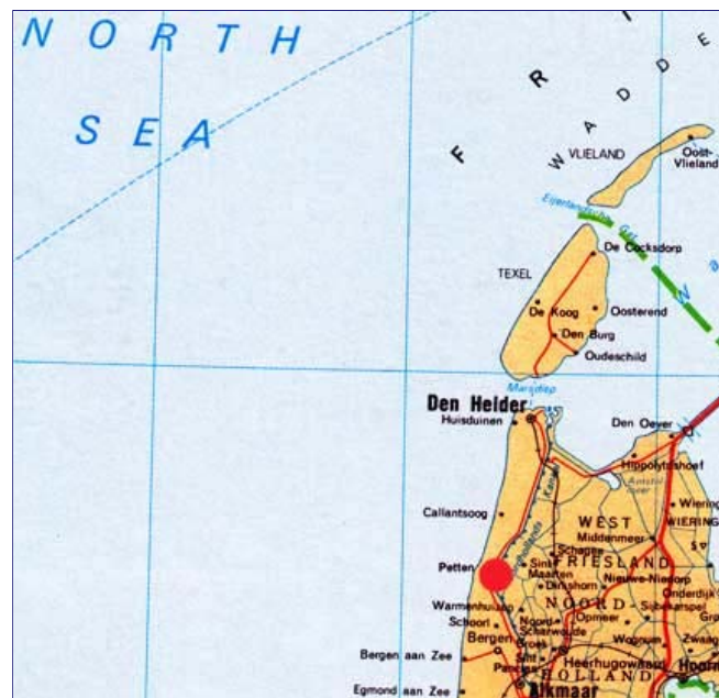
Petten (red circle) has a campground near the North Sea beach in northern Holland.

21) September 8, 2007 - Petten, Holland camp ground. [ 041709 Earthfiles ]