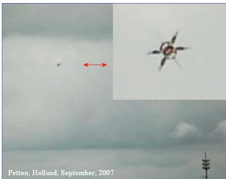
Saturday, September 8, 2007, around 1:30 PM in Petten, Holland, at camp ground. Original image © 2007 by Ruud Schmidt; blow-up overlay produced by UFOcasebook.com. The structure in the lower right corner is a Dutch air raid siren.