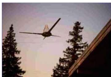
Another odd aerial “drone” photographed in Lake Tahoe, California, on May 5, 2007. Photographers requests anonymity.

Other 2007 photographs of dragonfly-shaped aerial objects began to emerge between May and June from Lake Tahoe, Capitola and Big Basin, California – all with appendages sticking out from a ring and the tall, thin wires extending high above. [ See Earthfiles Archive list below.]