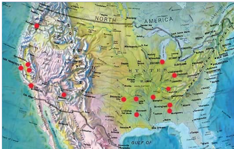
Red circles are the 15 regions known in the United States to date in which 20 eyewitnesses have reported seeing a wingless aerial craft with antenna appendages hovering and moving like a dragonfly, spanning 21 years from 1987 to 2008.

After the Big Basin craft photographs, other cases emerged in which eyewitnesses sketched odd, aerial “dragonfly”-shape aircraft.