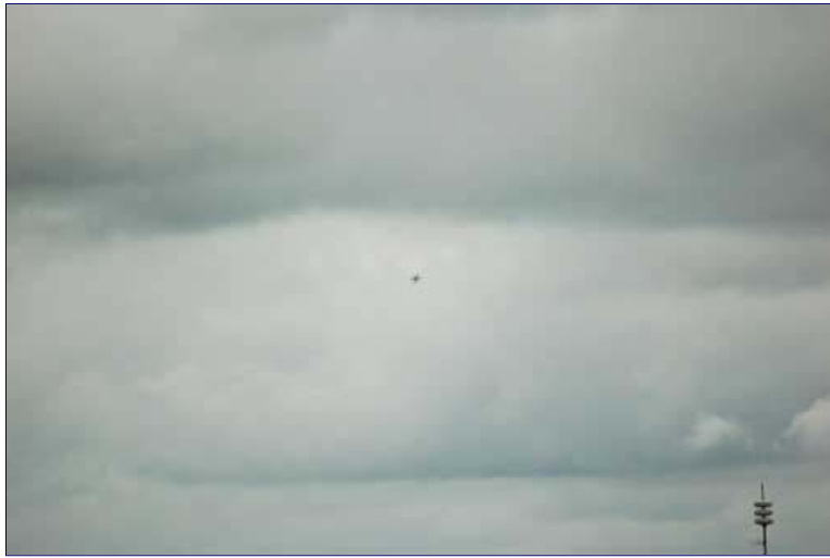
The structure in the lower right corner is a Dutch air raid siren.