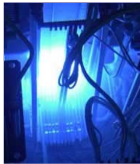
High Flux Reactor (HFR) during operation in Petten, Holland.

"The Petten unit is one of a few reactors that maintains global medical isotope supplies. Traces of gas bubbles were detected in the primary cooling system of the High Flux Reactor (HFR) at Petten in the Netherlands during the course of an August 2008 inspection. NRG described the finding as an 'anomaly' at the time, and explained that the bubbles were caused by corrosion of the pipe work of the primary cooling system.