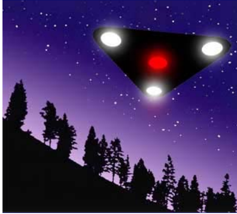
Artist's illustration of unidentified, silent, triangular aerial craft that haunted the Belgium skies in late March 1990.

On March 30, 1990, Brussels, Belgium, citizens spotted a large, black, triangular craft hovering silently over the city for several minutes. Local police officials arrived on the scene and reported observing the object as it hovered over apartment buildings. One officer reported that the object released a red glowing disk of light from its center which flew down to the ground and darted around several buildings before disappearing. The larger craft eventually departed at high speed.