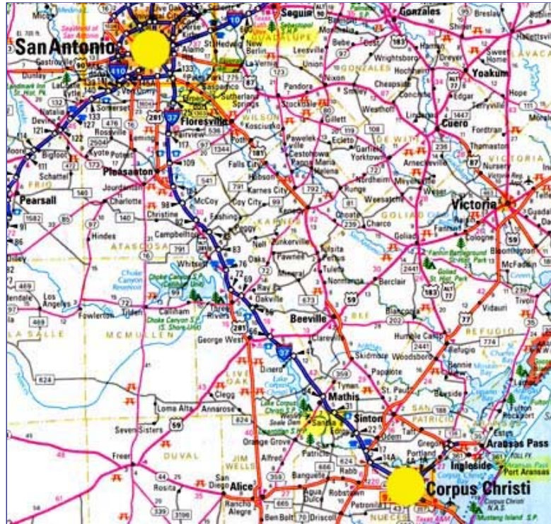
Corpus Christi, on the Gulf of Mexico, is 120 miles southeast of San Antonio. Both regions have had cat and cattle mutilations, as indicated by the yellow regions on the map.

On Monday evening, April 2, 2007, residents from the south side of Corpus Christi, Texas – especially those living on Stonemill Circle – met with a Corpus Christi Police Department representative to discuss the sad and disturbing mystery affecting their neighborhood since early November 2006 – the mutilation of house cats.