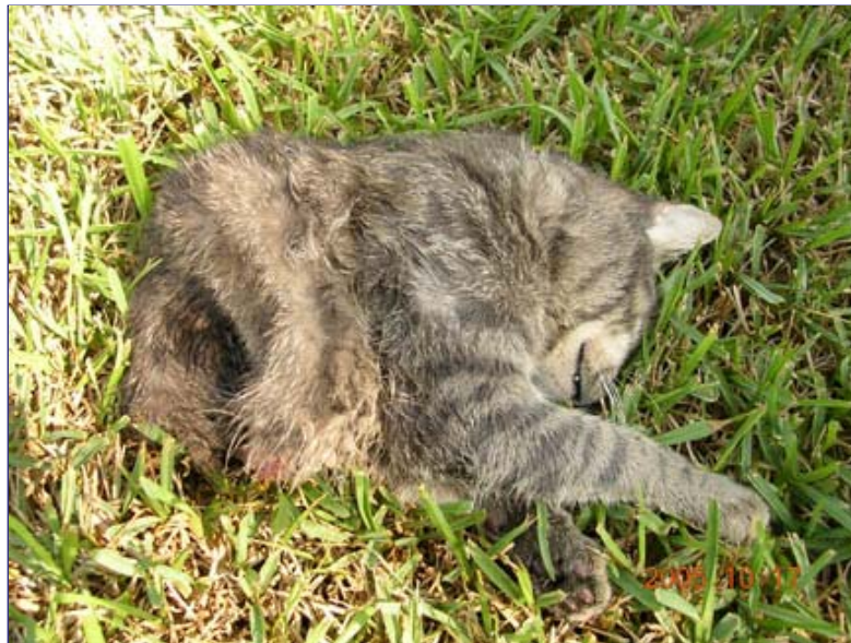
Half cat discovered October 17, 2005, San Antonio, Texas.

I talked with the veterinarian's office, which had no information about further Animal Control follow-up on the cat's body.