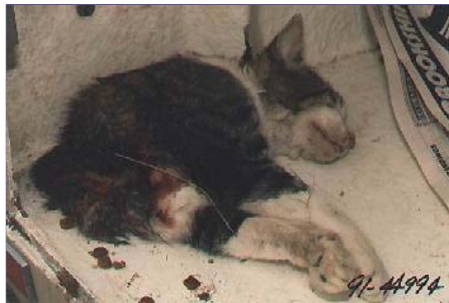
Half-cat photographed by Plano, Texas Police Officer for Incident Report No. 91-44994, August 31, 1991.