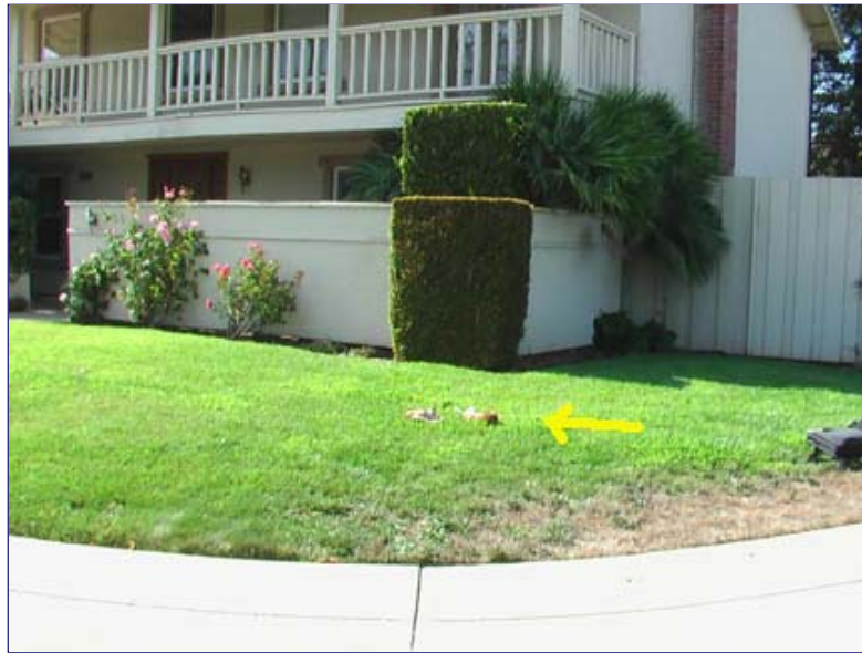
Cat cut in half, lying in front yard of south San Jose, California, home, discovered on August 16, 2005.

Today, August 16, 2005, about 4:00 PM, I was walking in a residential neighborhood in south San Jose, California, when I noticed the remains of an orange cat, in two pieces, on the front lawn of a home. I was on my way to a business meeting, but stopped long enough to snap some pictures. Attached are digital photos of the scene.