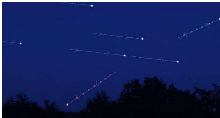
July 10, 2009, Dripping Springs, TX Eyewitness: "Saw # 1 and # 2 appear first heading Southeast. Then # 3, # 4 and # 5 appeared in order heading Southeast the same direction. About the time # 5 came into view, we saw # 6 shoot due East at a high rate of speed out of nowhere. # 5 then stopped and stayed motionless, 'like mimicking a star.' # 4 appeared faint and shot due West at a high rate of speed. Total time of sighting: Approx. 2 minutes. Tracked from NE to SSE." Graphic illustration by Texas eyewitness.

I have included a shot of our property facing the direction of sky where we witnessed the lights. I used MS paint to draw the lights, text and directional arrows. It is a dusk shot of that direction of sky from a few months ago. It has been cropped and I adjusted the coloring on it to make it look darker for illustration purposes.