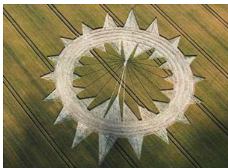
Part 1 of Cannings Cross near Allington, Wiltshire, England, showing June 27, 2009, first reported pattern after the angry farmer drove his tractor around in circles cutting off the points of the interior pattern.

Cannings Cross, Wiltshire, crop formation has evolved through farmer damage from June 27, 2009, to mysterious July 10, 2009, second stage reconstruction to July 13, 2009, arrest of farm employee with shot gun.