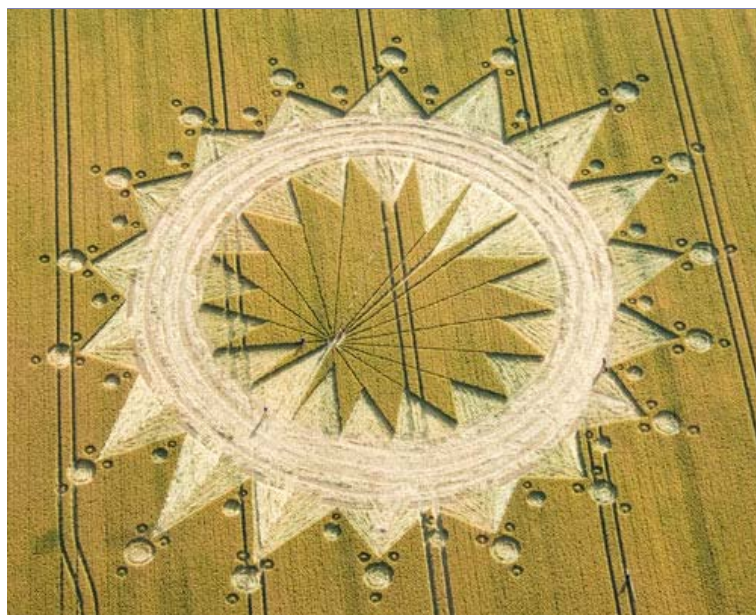
Part 2 of Cannings Cross near Allington, Wiltshire, England, reported on July 10, 2009, with additional circles at the outer points. Inside the farmer's original June 27th circles of wheat cut down, the cut off interior points have been reconstructed into fresh, new points. Aerial image © 2009 by Olivier Morel (WCCSG).

Then on Friday, July 10th, the formation was reported again to have extended with extra grape shots and neatened back up.