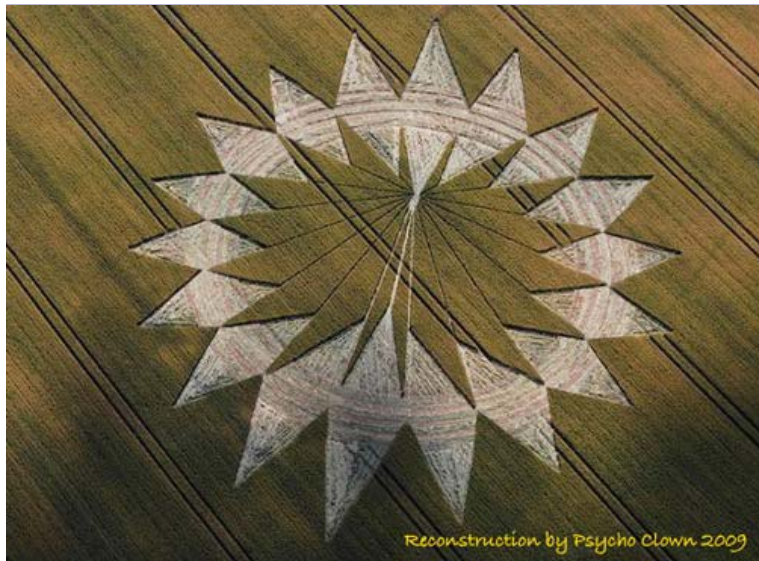
Photoshop reconstruction of formation to illustrate pattern before the farmer drove around in circles cutting off the inner points. Electronic reconstruction © 2009 by Psycho Clown.

the Crop Circle Connector Forum and was then subsequently transferred to the CCC page relating to the Cannings Cross formation, this file is called "canningscross2009.jpg."