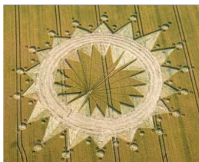
Part 2 of Cannings Cross near Allington, Wiltshire, England, reported on July 10, 2009, with additional circles at the outer points. Inside the farmer's original June 27th circles of wheat cut down, the cut off interior points have been reconstructed into fresh, new points. Aerial image © 2009 by Olivier Morel (WCCSG). For other images and information: Cropcircleconnector .

July 4, 2009 Cannings Cross near Allington, Wiltshire County, England - The Cannings Cross wheat pattern near Allington, Wiltshire, England, has been evolving through great confusion. The farm owner originally took his tractor into the first part of the formation reported on June 27, 2009, and drove in big circles to cut down the interior