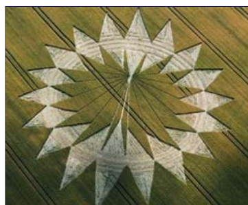
Photoshop reconstruction of formation to illustrate pattern before the farmer drove around in circles cutting off the inner points. Electronic reconstruction © 2009 by Psycho Clown.