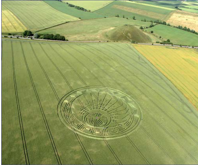
The unusual "mountain shading" can be seen in this aerial photograph on the far side of the circle nearest Silbury Hill.

Wherever that formation came from, that is a pretty incredible thing! It's my opinion that it came from upstairs rather than downstairs.