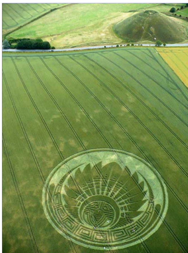
Silbury Hill “Quetzlcoatl Headdress” about 350 feet in diameter first discovered around 4:30 AM by documentary film crew that had been camped all night atop Silbury Hill and were first into the extraordinary pattern. Aerial image © 2009 by Jack Roderick.

- Charles Mallett, Silent Circle Research Centre