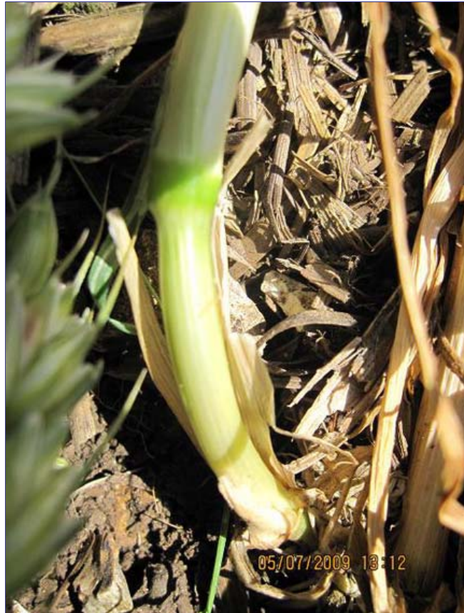
Close-up of wheat stem laid to the ground without break or crease, which biophysicist W. C. Levensgood hypothesizes is caused by microwave and electric energies from a spinning plasma vortex that comes down from the sky and interacts with the plants, rapidly heating the cell water so that the tissues soften and collapse into the various crop formation patterns.

Charles Mallett: “By the time I got to the formation, there were large numbers of people arriving. It’s amazing how word seems to spread! There is an effort not to spread word very fast because the formations need careful consideration before the busloads arrive. Once a lot of people have been in a crop circle, there is a lot of damage.