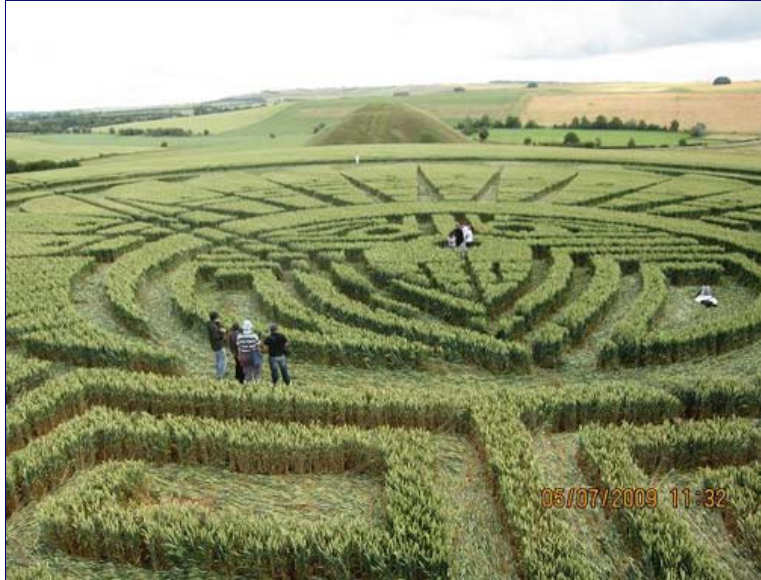
With 5,000-year-old Silbury Hill rising 130 feet high in the background, Charles Mallett used a 6-meter-long pole (19 feet) upon which his digital camera was mounted to take this photograph at 11:32 AM on the morning of July 5, 2009, about seven hours after the film crew that camped on top of Silbury Hill the night of July 4 to 5, 2009, first walked into the “immaculate” pattern covered with thick dew around 4:30 AM at sunup.