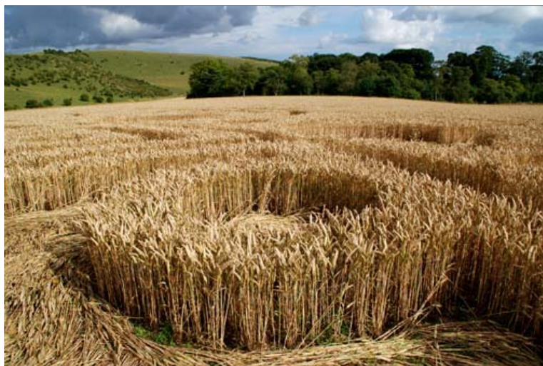
Round character that repeats around the inside of the central core of the Ogbourne St. George pattern.

Then there were larger features such as this round character that repeats around the inside of the central core of the formation. The rings of standing wheat throughout the formation were clean and unbroken.