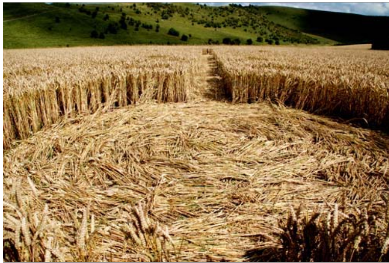
Criss-crossed, disheveled “facets” of wheat inside only one of twelve larger circles around the central core of the Ogbourne St. George formation. Often these seemingly chaotic lays create 3-dimensional impressions from the air.

When we walked another several hundred feet, we finally got to the edge of the huge pattern. One of the first features that struck Gill and me as unusual was one of the larger circles around the center core was “woven” or “faceted” as if to project a 3-dimensional image from the air, as some formations that appear disheveled on the ground turn out to create 3-dimensions in aerial images. But when we finally saw aerials at Cropcircleconnector.com , curiously, we cannot detect the faceted circle that was so prominently different from the other eleven on the ground inside the formation.