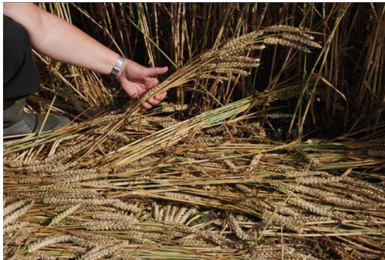
Gill Nicholas holding up top layer of wheat to expose the cross-hatched layers below, in this case we counted five layers deep. In other places I found as many as seven layers deep.

degrees to the 90-degree cross-hatching layers underneath.