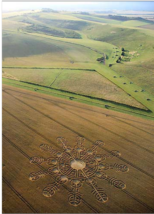
12-arms "beaded" with Mayan glyphs reported Friday, July 24, 2009, in the Gallops between Ogbourne St. George and Barbury Castle, Wiltshire County, England. Aerial image © 2009 by www.VisibleSigns.de .