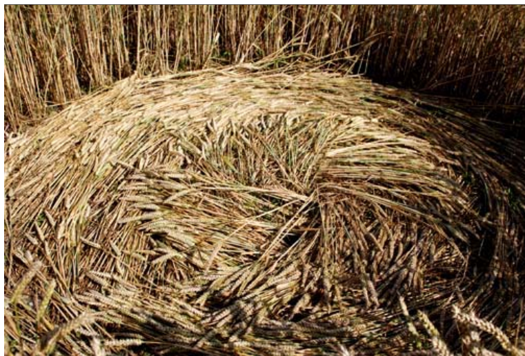
Other striking features were the different weaves in each of the 48 small circles throughout the formation.

Another impressive feature of the Ogbourne 12-armed pattern is there were different weaves in each of the 48 small circles throughout the formation, some exquisite fountains surrounded by unbroken rings of standing wheat. One circle had a “bouquet” of wheat heads arranged artistically in the center of a small circle.