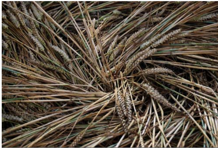
"Bouquet" of wheat heads arranged artistically in the center of one of the 48 small circles in the Ogbourne St. George 12-arm pattern reported July 24, 2009.

Then there were larger features such as this round character that repeats around the inside of the central core of the formation. The rings of standing wheat throughout the formation were clean and unbroken.