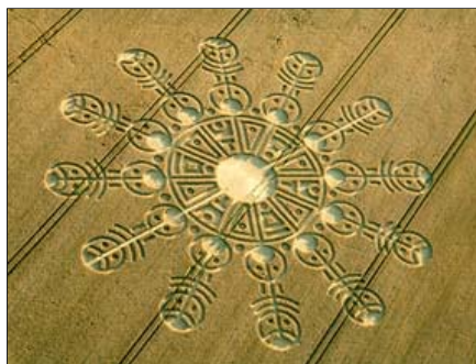
Smeathe's Plantation near Ogbourne Down Gallop, Wiltshire, England, reported July 24, 2009. Aerial image © 2009 by Lucy Pringle. Other images and information: Cropcircleconnector.com .