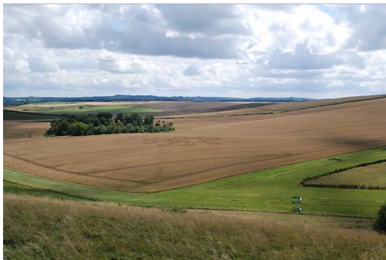
Gill's and my perspective on the estimated 200-foot-diameter wheat pattern with its 12-arms