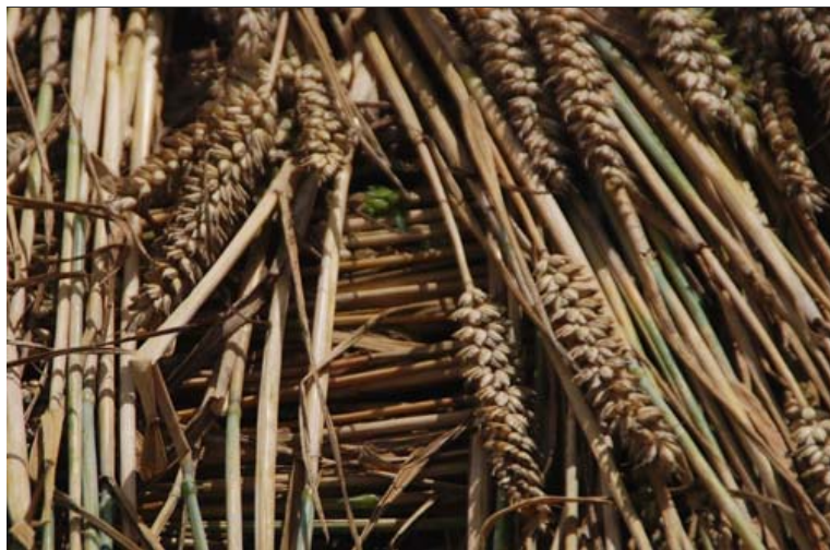
Close-up on one of five cross-hatched layers in the Ogbourne St. George wheat formation reported July 24, 2009.

I walked the formation's main corridor that runs north-south from a lower altitude to higher altitude and found the place where the north-south axis crossed the farmer's tractor tramlines. That means that the creators of the 12-arm pattern did not utilize the existing tramlines, but oriented the whole pattern on its own axis.