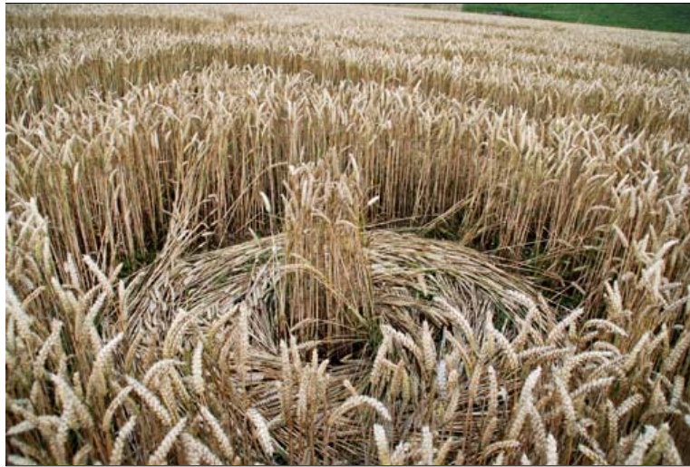
A fountain of wheat surrounded by unbroken circle of standing wheat, one of many different variations inside the 48 small circles throughout the formation.