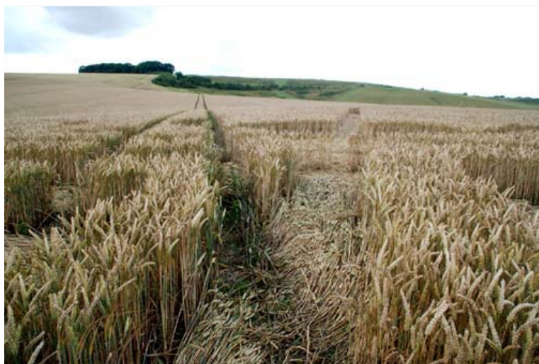
On left is the farmer's tractor tramline; on the right is the end of the main north-south axis in the 12-arm geometry, rotated away from the tramline.

I walked the formation's main corridor that runs north-south from a lower altitude to higher altitude and found the place where the north-south axis crossed the farmer's tractor tramlines. That means that the creators of the 12-arm pattern did not utilize the existing tramlines, but oriented the whole pattern on its own axis.