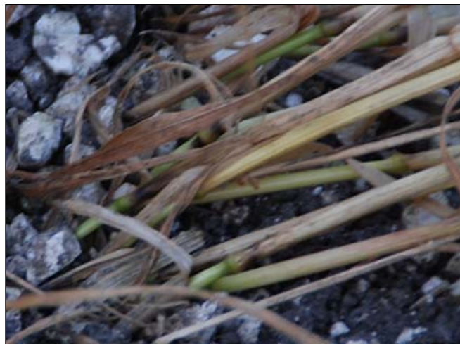
All around the perimeter of the wavy wheat, I found stems flat to the ground without any crease or break.