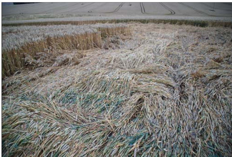
Between the watery, choppy waves and the interior details was a border made of cross-hatched wheat, each section about 4-feet-wide laid down in 90-degree-angles to each other.