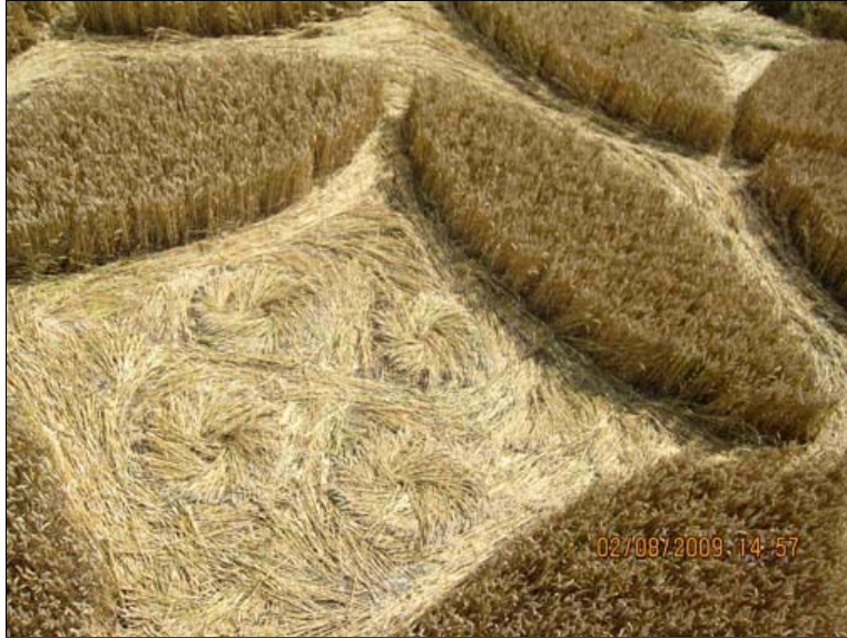
Four delicate swirls at center of Morgan's Hill wheat formation reported August 2, 2009, near Bishop Cannings, Wiltshire County, England.