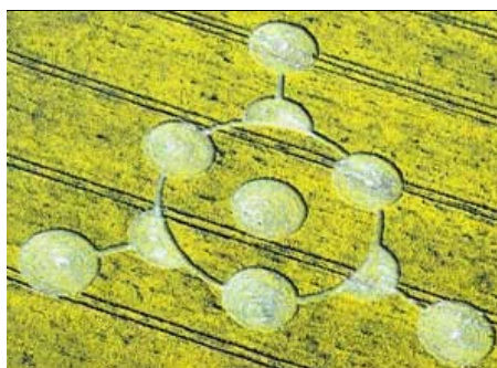
“Lunar cycle calculator” reported April 24, 2009, in flowering oilseed rape at Morgan's Hill, Wiltshire, England, the first 2009 pattern near the ancient settlement hill. Other information and images: Cropcircleconnector.com.