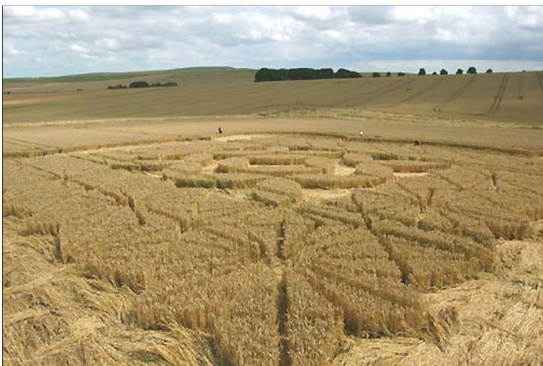
Pole shot above interior pattern surrounded by 90-degree cross-hatching border. More information and images: Cropcircleconnector.com .