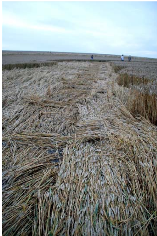
The Australian scientist counted 20 cross-hatches on each side of the pattern and wonders if that relates to the Mayan 20-day-count calendar? If so, could this Morgan's Hill August 2, 2009, pattern be pointing to an upcoming date 80 days from the formation's appearance? That might coincide with the appearance of a comet in October 2009? See: LunarMeteoriteHunters.com