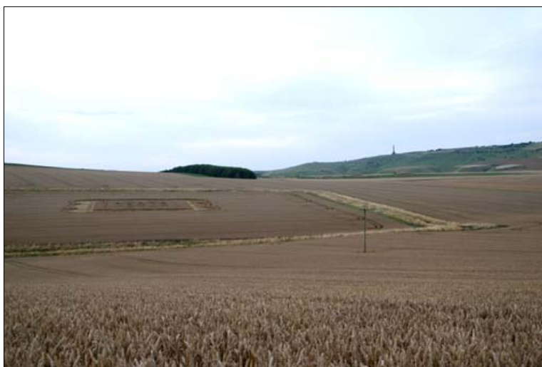
After a long mile walk, the land rises near Morgan's Hill where I first saw the new rectangular formation come into view. In the background atop Cherhill is the Guglielmo Marconi obelisk. Marconi invented the radiotelegraph and received the 1909 Nobel Prize for Physics.