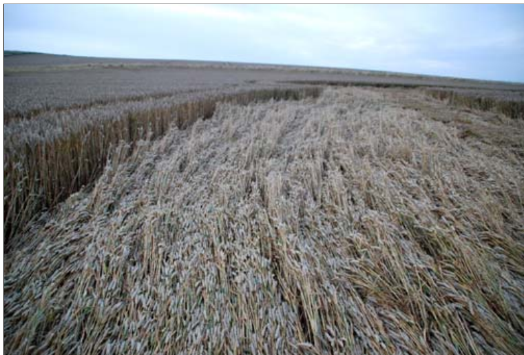
The watery, choppy waves of the wheat forming the perimeter around the more detailed central pattern at first seemed chaotic.