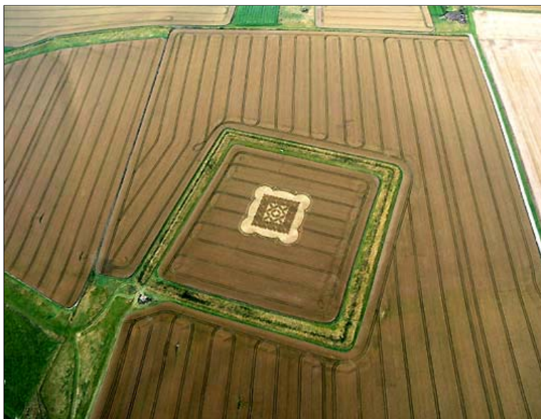
Rectangular wheat “settlement” pattern within ancient Morgan's Hill Celtic settlement border reported August 2, 2009, at Morgan's Hill near Bishop Cannings.