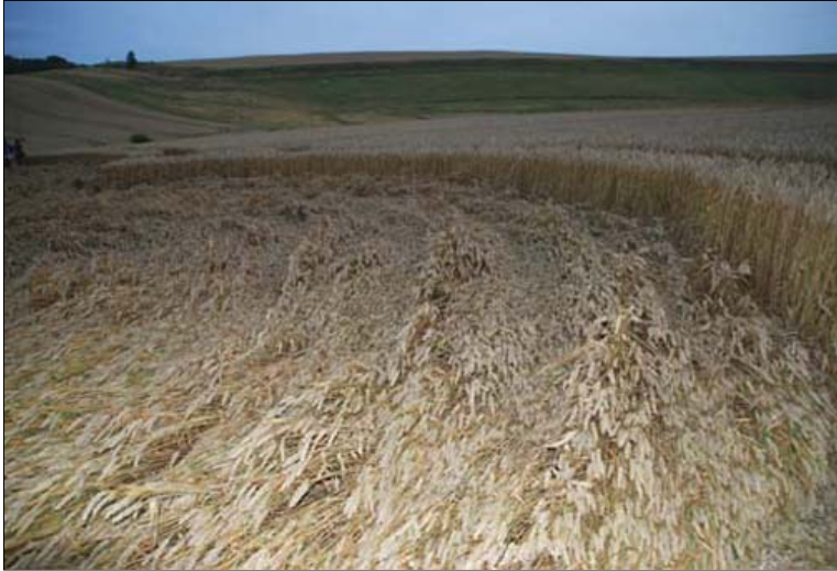
As the sun set, the waves were more pronounced in the camera flash.