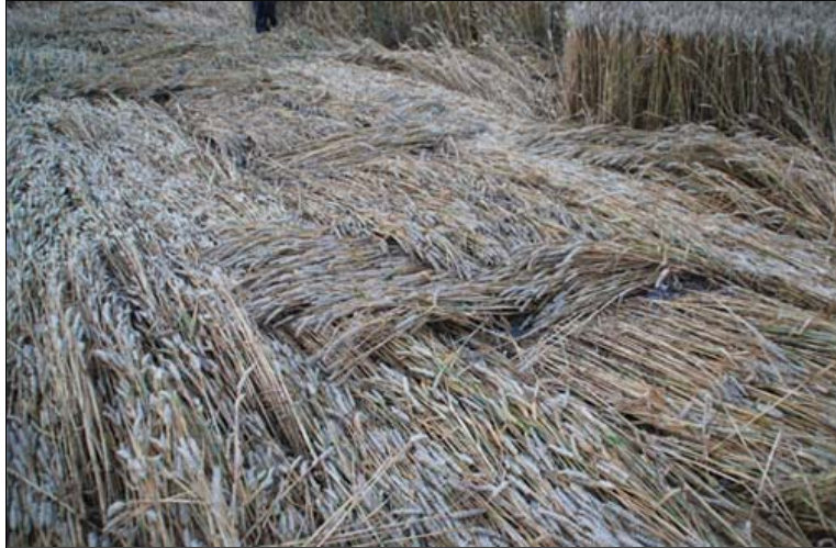
Another angle on the 90-degree-angled cross-hatching around the entire central pattern.