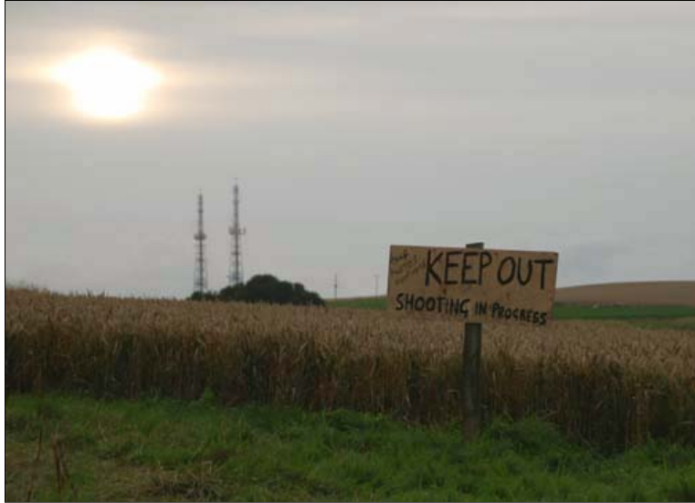
Nearby was an ominous hand-written sign, “KEEP OUT Shooting in progress, Take photos from here.” Turned out the shooting was not at us, but a clay pigeon machine to make noise to keep pigeons and other birds away from crops.