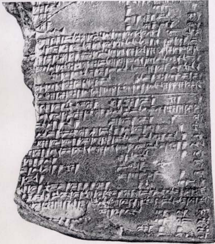
Part of the tablet supposed to contain a mention of the Babylonian Garden of Eden (K. 111).