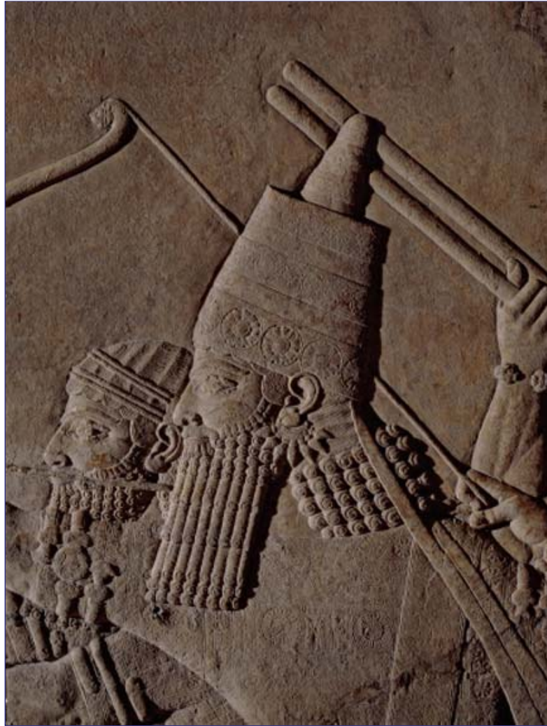
King of Assyria, Ashurbanipal, depicted in stone on a chariot during a royal lion hunt during his reign of 668 to 627 B. C.

[ Editor's Note: AbsoluteAstronomy.com reports: “The Royal Library of Ashurbanipal, named after Ashurbanipal, the last great king of the Neo-Assyrian Empire, is a collection of thousands of clay tablets and fragments containing texts of all kinds from the 7th century BC. The materials were found in the archaeological site of Kouyunjik (then ancient Nineveh, capital of Assyria) in northern Mesopotamia. The site would be found in modern day Iraq. It is an archaeological discovery credited to Austen Henry Layard; most texts were taken to England and can now be found in the British Museum, London.” ]