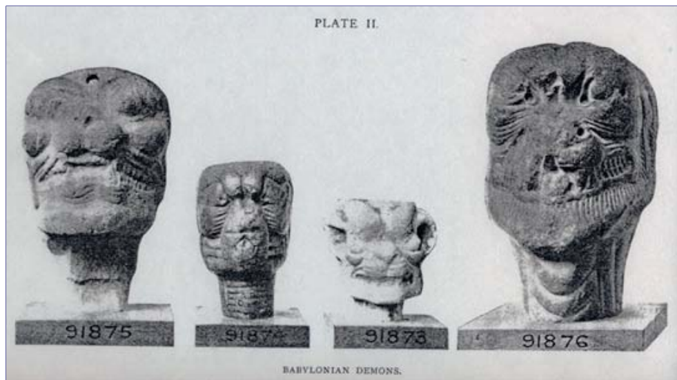
Babylonian demons were sculpted as humanoid reptiles.