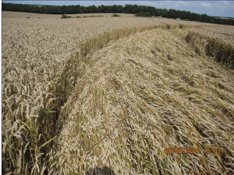
More straightened seed heads in flowing, downed wheat of formation in contrast to stiff, curled seed heads in standing crop. Background is village of Lockeridge, Wiltshire, England.