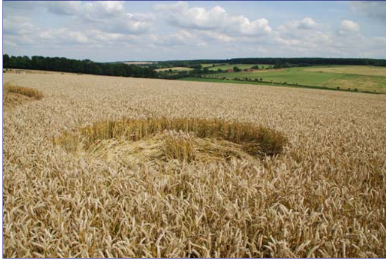
One of four corner grapeshot circles with fountain dotting the West Overton wheat formation first reported on August 8, 2009.