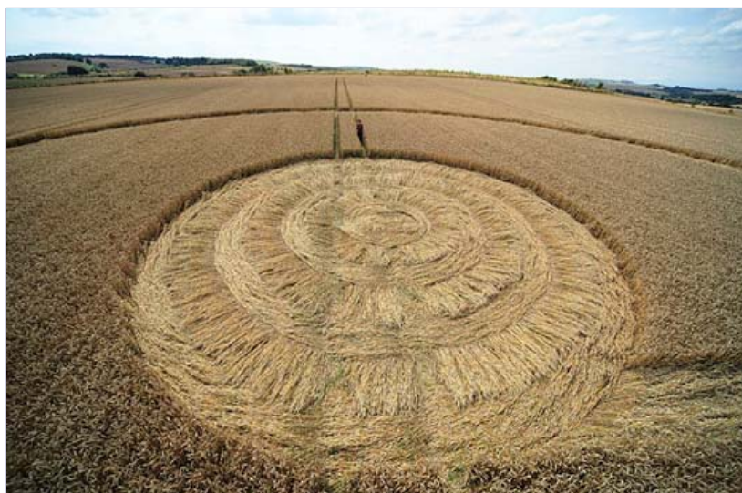
Pole shot of far western circular bands