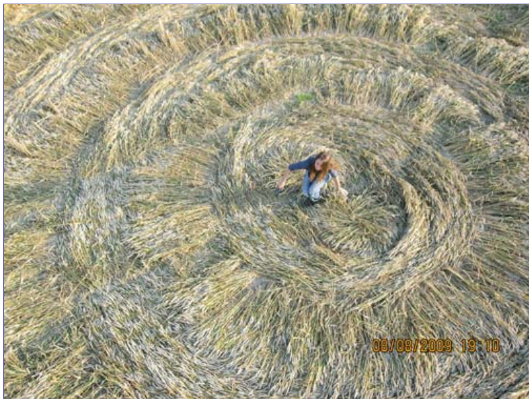
Circular bands around two central fountains in far western circle of West Overton wheat formation, above and below, reported August 8, 2009.