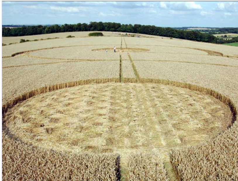
Woven center of larger central circle in the West Overton 450-foot-long wheat formation reported August 8, 2009. Pole image © 2009 by Stuart Dike, Cropcircleconnector.com .