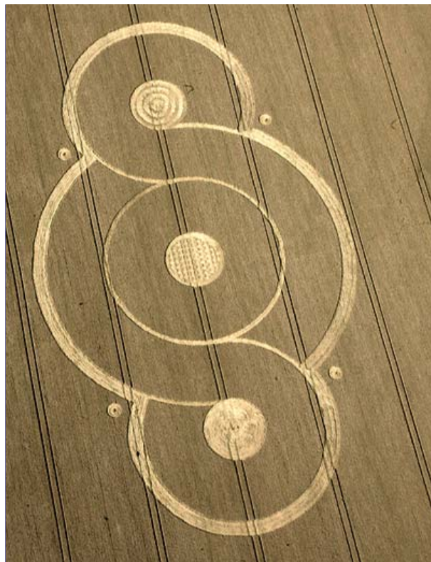
450-foot-long geometry at West Overton near Lockeridge, Wiltshire, England, reported August 8, 2009. Aerial image © 2009 by Lucy Pringle . More information and images: Cropcircleconnector.com .

The next morning of August 8, 2009, Jaime Maussan from Mexico City and I received news that another new formation had been seen from the air at West Overton near Lockeridge. We headed there and met up with Charles and others, all of us trying to get into the fresh formation before it was trampled by tourists or cut out by the farmer.