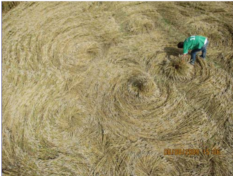
Downed wheat flowing like water to form seven fanned out circles around two fountains in the center of the eastern most circle of the West Overton formation reported August 8, 2009.

As I stood marveling at the liquid gracefulness of what should have been stiff, mid-August wheat, my eye was attracted toward Lockeridge about a mile north of the formation. “Oh, my God, it’s one of those aerial, flickering mirrors!”