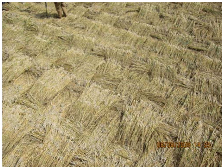
Woven central larger circle composed of 90-degree overlapping swaths of wheat.