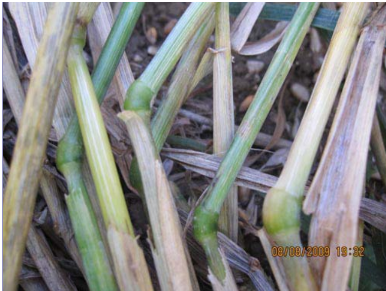
Elongated and reoriented growth nodes were caused by biophysical and biochemical changes in the wheat plants. Biophysicist W. C. Levensgood hypothesizes that a spinning plasma vortex containing microwave and electrical energies comes downward from the atmosphere and rapidly heats and collapses some plants, affecting growth nodes, while leaving other plants standing.