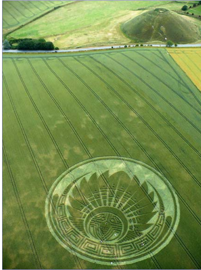
“Quetzalcoatl Headdress” about 350 feet in diameter first discovered July 5, 2009, around 4:15 AM by documentary film crew that camped from 3:00 AM onward atop Silbury Hill on the north side of the Roman Road separating Silbury and the hilltop wheat field.