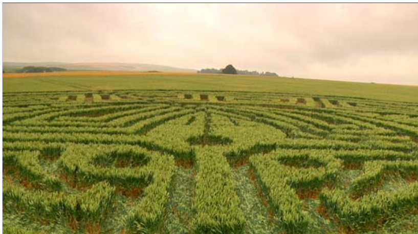
“Quetzalcoatl Headdress” Atop Wheat Field Across Road from Silbury Hill