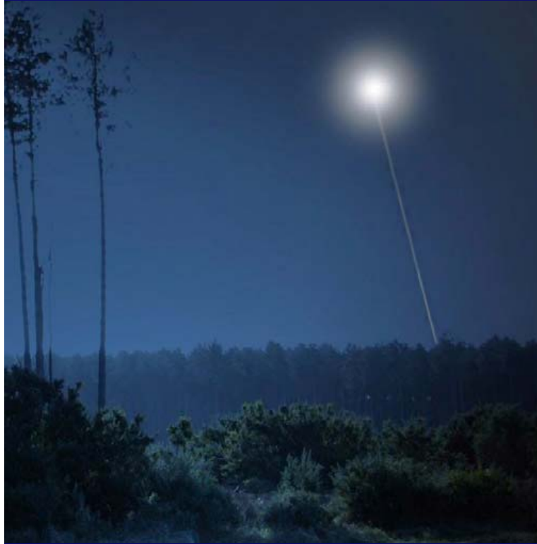
Lt. Col. Charles I. Halt described mysterious aerial light that emitted white, narrow, beam down in front of him and over the weapons storage facility (above), said to contain nuclear warheads, at RAF Bentwaters, England, in the early morning hours of December 28, 1980. Illustration by Jan Roth at www.rendlesham-incident.co.uk used with permission.