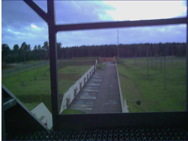
December 2007, photograph from RAF Bentwaters/Woodbridge tower used to monitor underground Weapons Storage Area (WSA), that presumably included nuclear weapons heavily guarded in December 1980 by military security.