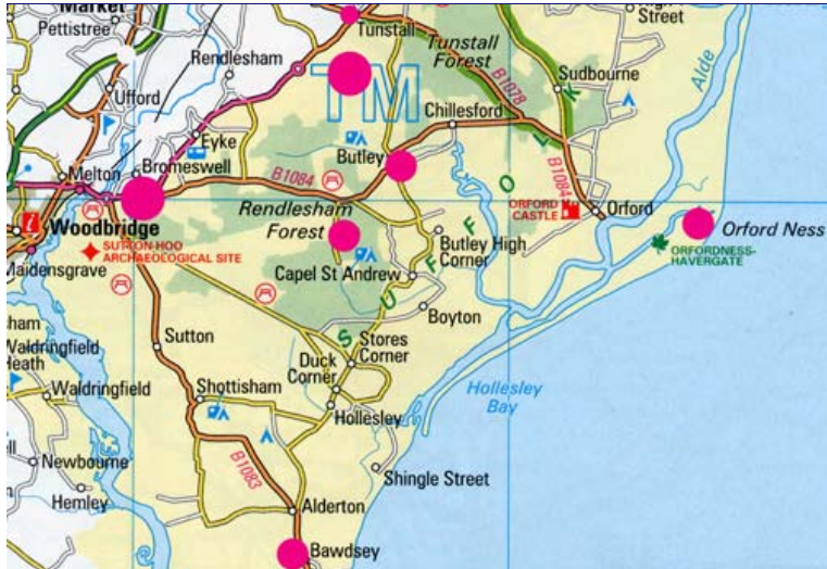
Farmer's field in general area of central pink circle in Rendlesham Forest near Capel St. Andrew, England. The Orford Ness lighthouse is the far right pink circle. RAF Bentwaters is top large pink circle, 4 miles northeast of RAF Woodbridge, pink circle at Woodbridge.

THIS WAS THE EARLY MORNING HOURS OF DECEMBER 28TH?