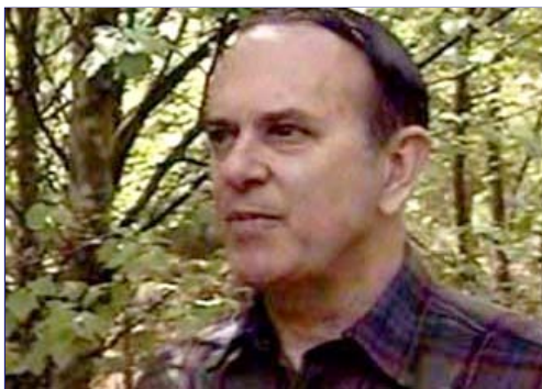
Col. Charles I. Halt (Ret.), former Deputy Base Commander at RAF Bentwaters, England, December 1980, photographed in Rendlesham Forest during 2007 TV production.

“I wish to make it perfectly clear that the UFOs that I saw were structured machines moving under intelligent control and operating beyond the realm of anything I have ever seen before or since. I believe the objects that I saw at close quarter were extraterrestrial in origin and that the security services of both the United States and England were and have been complicit in trying to subvert the significance of what occurred at Rendlesham by use of well-practiced methods of disinformation.”