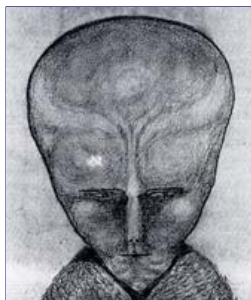
Drawing by Aleister Crowley of "Lam, an extraterrestrial" after alleged 1919 contact, as reprinted in The Magical Revival © 1991 by Kenneth Grant.

"In effort to establish contact with non-human entities, every avenue is being explored." - The Writers