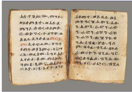
Ethiopian Bandler of Righteousness in Ge'ez script on parchment.

Other comments came from a Florida resident who has studied the UFO phenomena for most of her life. Her letter dated August 20, 1994, begins with her reaction to the content in the Writers two letters.