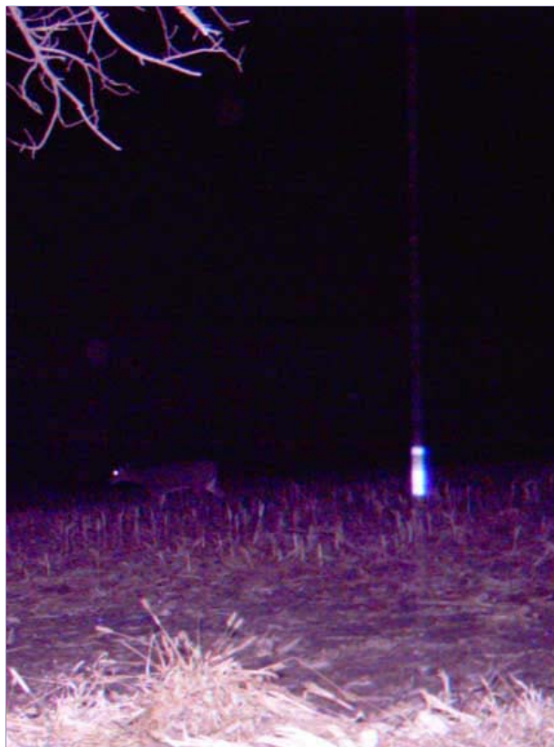
Image 1 at 3:59 AM cropped. In the foreground are grass and weeds for a distance of 10 or 12 feet from the camera. Then a combine-flattened area and beyond that, harvested corn stubble where the deer is walking. Estimated distance from camera to strange object is 10 to 20 feet.