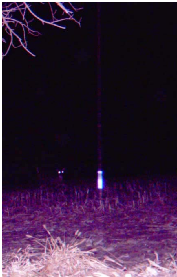
Image 4 at 4:01 AM cropped to show the alarmed deer, object's detail and "rays" above and below strange object.

In the next (5th) picture, the deer is gone, the object has moved back to the right.