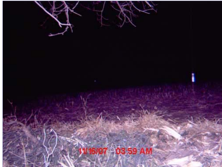
Image 2 at 3:59 AM. The small white spot near center of this and the other images is a neighbor's yard light approximately 3/4s of a mile distant.

The 2nd picture, there is no deer. The strange object has moved to the right slightly.