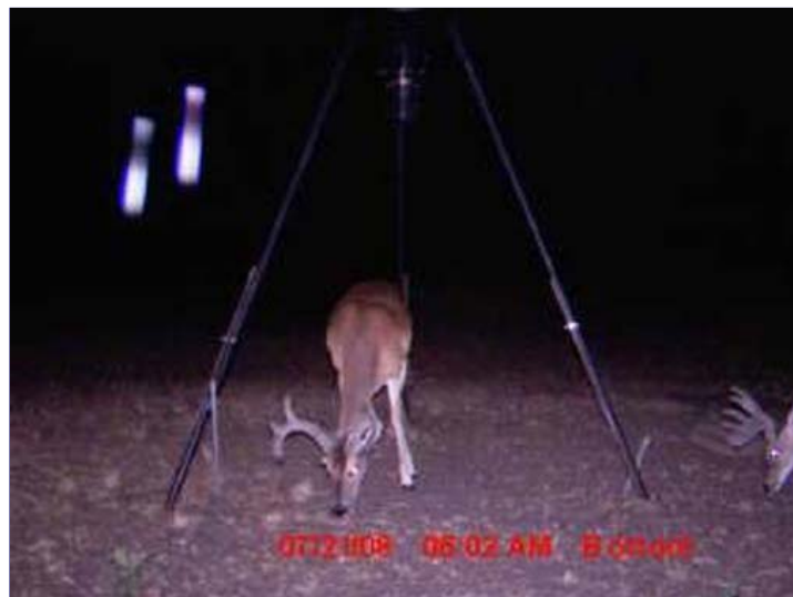
Harold Sutton, near Ft. Hood, Texas: “I have three Moultrie 4.0 game cameras on our place here in Central Texas [ near Ft. Hood] that we have been monitoring since January 2008.

1) July 21, 2008, Game Trail Camera Time: 6:02 AM Central Near Ft. Hood, Texas