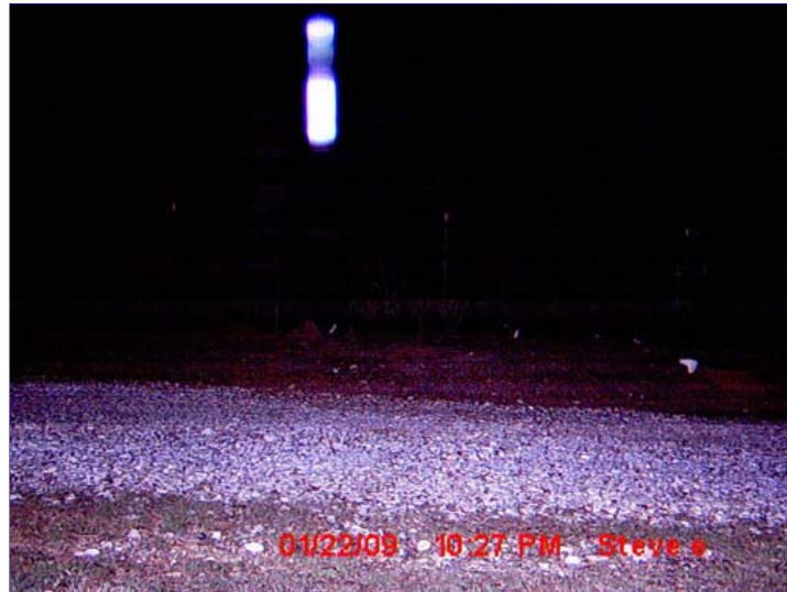
Above and below, two game trail images from Auburn, Alabama, dated January 22, 2009, at 10:27 PM Central.

We have had 3 distinctive types of unexplained lights. First were round lights showing up in pictures where nothing should be. Next came beams of lights that were above the ground, but didn't touch the ground and on most occasions did not extend into the sky as high as the camera took the picture. This morning (July 21, 2008) at 6:02 am, with 2 bucks at the feeder, a small round light appeared under the feeder. The camera is set with an 8 second delay and 8 seconds later, 2 lights resembling milk bottles (like the ones in your November 2007 photos) appeared in my picture. They look to be about 4 to 5 foot off the ground and just to the left of the feeder. 2 bucks under the feeder did not seem to be aware they were there. I have made copies of many of the pictures of lights we have seen. Have you been able to find out any thing on the strange lights, yet?" 072108 at 6:02 AM Central