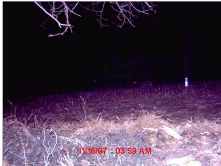
Above: Image 1 at 3:59 AM Central, November 16, 2007, Oregon, Illinois. Camera: Moultrie GameSpy D-40 Digital Flash Trail ( 4 megapixel). Below: Image 1 cropped to show the deer walking by, the object's detail and “rays” above and below.

Bob Coine: “In the first picture, a deer is triggering the camera as the deer walks by. The deer appears to be 30 or 40 yards out from the camera, maybe a little bit farther. It’s just a normal deer-walking-by photograph with that white thing on the right side of the frame.