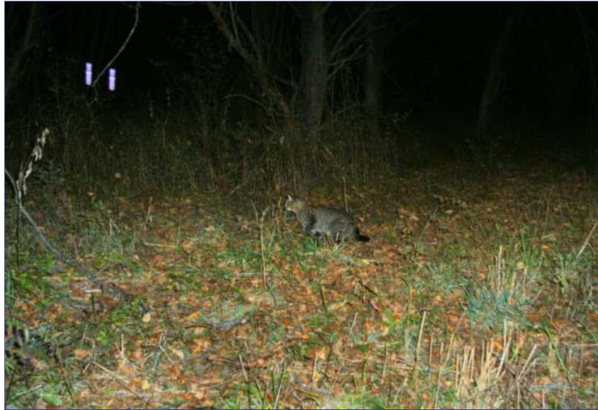
October 19, 2008 8:24 PM.