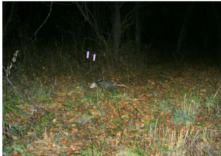
October 19, 2008 8:34 PM.

Click for website: Moultrie Gamespy D-40 Digital Flash Trail Camera (digital gain camera, 4 megapixel)