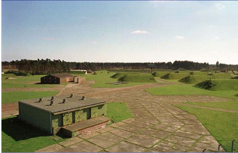
RAF Bentwaters view of Weapons Storage Area (WSA) from Victor Alert tower.