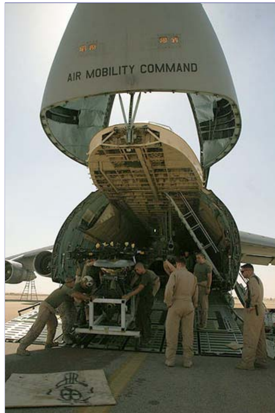
A C-5 Galaxy offloads its cargo.

[ Editor's Note: Wikipedia - The Lockheed C-5 Galaxy is a large, military transport aircraft built by Lockheed. It was designed to provide strategic heavy airlift over intercontinental distances and to carry outsize and oversize cargo. The C-5 Galaxy has been operated by the United States Air Force since 1969 and is one of the largest military aircraft in the world.]