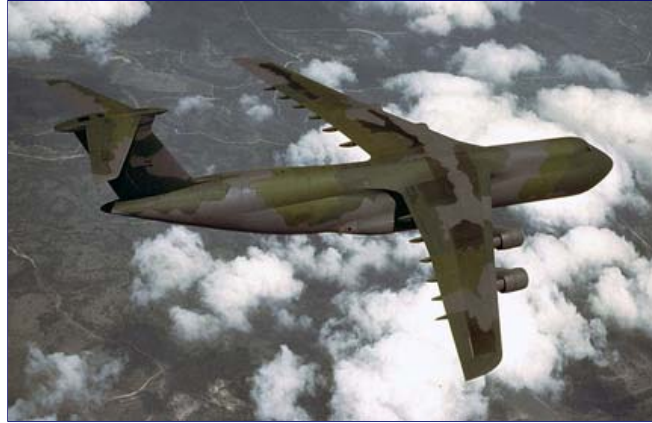
C-5 Galaxy flying in June 1970.