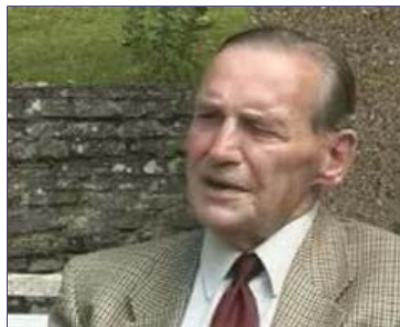
Lord Peter John Hill-Norton. February 8, 1915 - May 16, 2004.