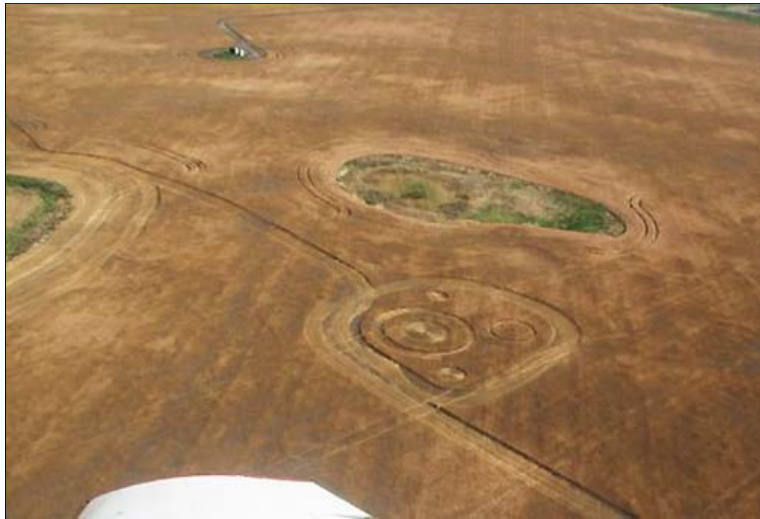
Green, shallow, slough behind wheat formation.