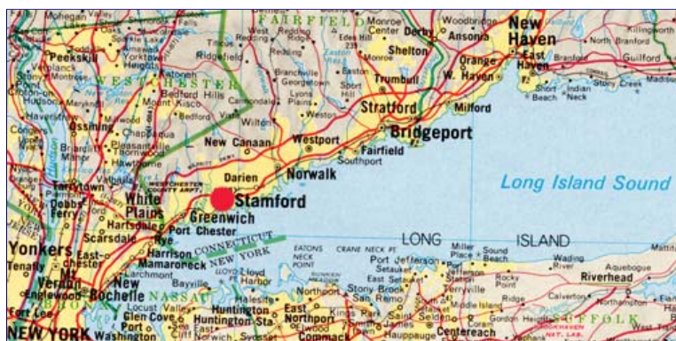
Stamford, Connecticut, is on Long Island Sound northeast of New York City.