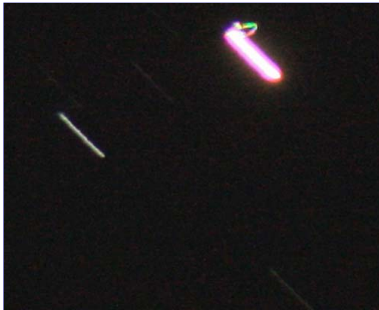
Friday, September 25, 2009, other Canon Rebel digital images of unusual, 3-dimensional, colorful structure, cropped. Paralleling the anomalous aerial object are the fainter lines of star tracks during the camera's time exposure.

THE LIGHTS ARE 3-DIMENSIONAL. THEY HAVE OVERLAPPING PARTS. ALSO, YOU CAN SEE THE NORMAL STAR TRAILS IN YOUR TIME EXPOSURE.