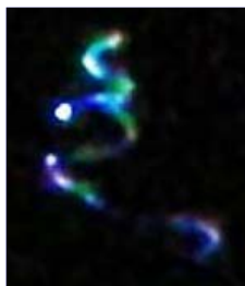
Left: Kokomo, Indiana, one of series of aerial light photos courtesy of Dustin Cronkhite, taken between 10 to 11 PM Central, on April 16, 2008. Right: Flashing light photographed through telescope around 11:45 PM Central, in Oswego, Illinois, on Saturday, April 5, 2008. Image © 2008 by Gabrielle Johnson. See: January 29, 2009 Earthfiles.