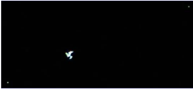
Normal stars in opposite corners with mysterious multiple-colored object changing patterns between. December 10, 2008, 9 PM Pacific, over Washoe Valley South of Reno, Nevada. See January 29, 2009 Earthfiles .

Compare to February 14, 2009, 9 PM Central, Over Elmwood and Plum City, Wisconsin