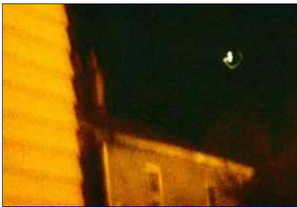
Cropped digital image taken at 7:22 PM Eastern, January 3, 2009, Empire, Ohio. See: January 29, 2009 Earthfiles.