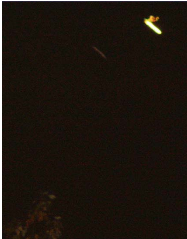
Canon Rebel digital image, cropped, taken Monday, September 21, 2009, in Fryeburg, Maine. The anomalous, colorful, light is in the upper right corner. Parallel to it is the faint pink streak of a star trail in time exposure. Lower left is top of tree.