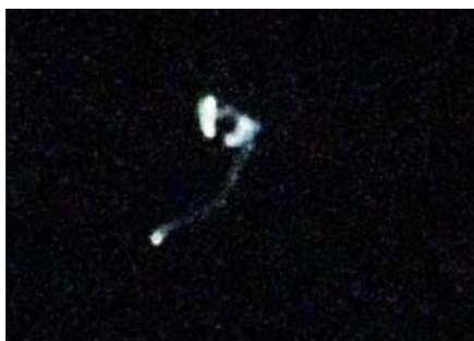
Images of changing patterns produced by bright, unidentified aerial light taken on February 14, 2009, between 6 PM and about 9:30 PM to 10:00 PM Central by John Smith from his home between Elmwood and Plum City, Wisconsin, looking east. See: February 27, 2009 Earthfiles .

Compare to January 3, 2009, 7:22 PM Eastern, Over Empire, Ohio