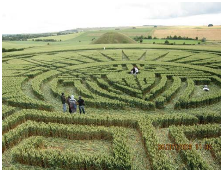
With 5,000-year-old Silbury Hill rising 130 feet high in the background, Charles Mallett used a 6-meter-long pole (19 feet) upon which his digital camera was mounted to take this photograph at 11:32 AM on the morning of July 5, 2009, about seven hours after the film crew that camped on top of Silbury Hill the night of July 4 to 5, 2009, first walked into the “immaculate” pattern covered with thick dew around 4:30 AM at sunup.

Andy Russell is continuing to investigate and more details might be forthcoming in the future. If anyone has more information about high strangeness around the Silbury Hill “Quetzalcoatl Headdress,” please email earthfiles@earthfiles.com .