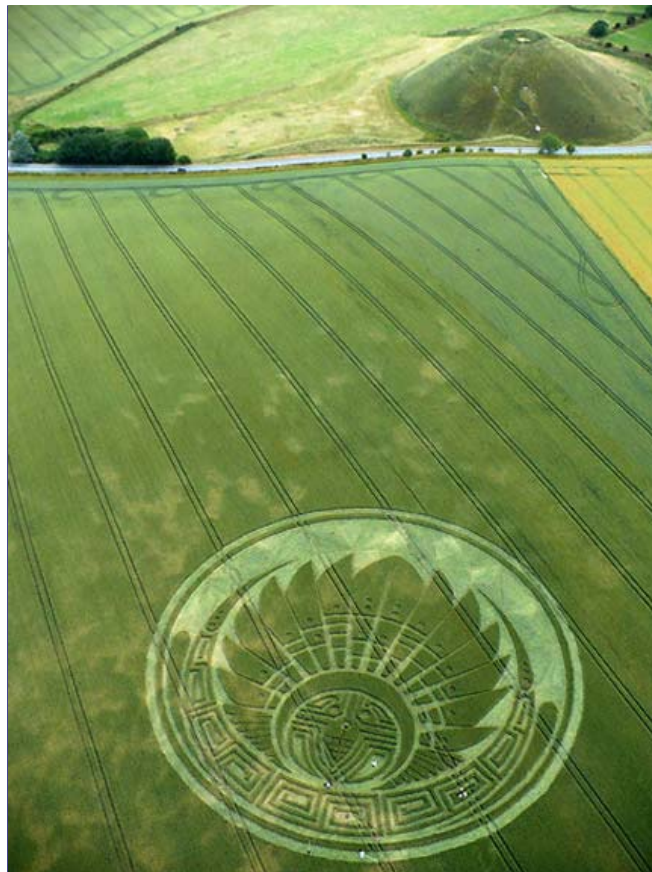
“Quetzalcoatl Headdress” across old Roman Road from ancient Silbury Hill, first reported at sunup on July 5, 2009. For other images and information: Cropcircleconnector.