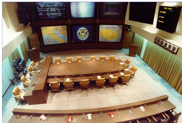
Emergency Conference Room (ECR) of National Military Command Center (NMCC), located in the Joint Staff area of the Pentagon, Washington, D. C.

The more than 300 people in the NMCC have responsibilities that are operational in nature, and thus it is not funded and maintained by the Joint Staff. The Air Force, as the executive agent for NMCC support, provides logistical, budgetary, facility and systems support.]