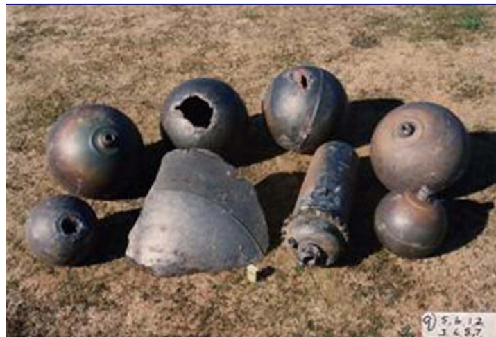
Back row: Group of four similar-sized titanium alloy spheres found on April 3, 1972, by farmer John Lindores about 10 miles south of Ashburton. Front row: Two smaller spheres, larger spacecraft piece and cylindrical structure found further south of John Lindores farm.