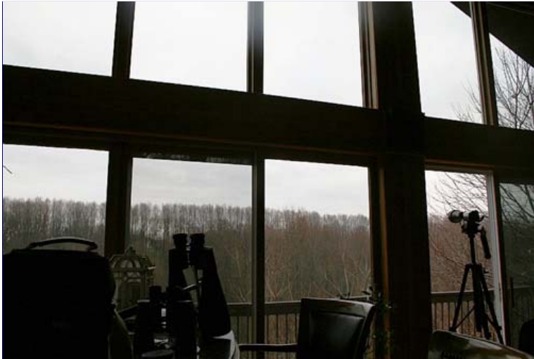
Alison Kruse livingroom overlooking woods about 700 feet from the house in Murrysville, Pennsylvania, about 20 miles east of Pittsburgh. Astronomical binoculars on table and Sony HDR-VF500 HD digital camcorder mounted on tripod at right.

This made us start looking at the sky more often. I have a living room that is glass on three sides. It's Alpine style. The ceilings are 16 feet high and it's all glass on the side that faces the woods, floor-to-ceiling glass, 25 feet long.