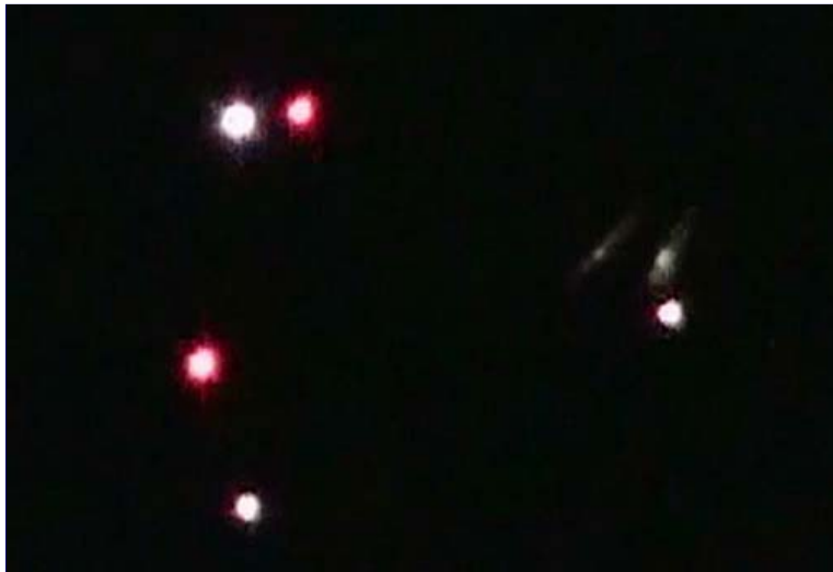
Video frames on November 18, 2009, in Murrysville, Pennsylvania, on Sony camcorder with 12X optical zoom w/1.7X teleconversion lens only. "This object turned on a rather low-volume jet engine noise."

Then this object turned on a rather low-volume jet engine noise. I found this funny as I filmed a similar mimicking object rising out of woods over Duff's Park high on a steep hill with three others on September 25, 2009.