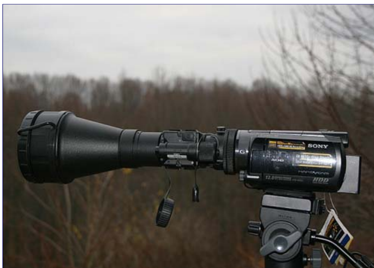
Sony HDR-VR500 HD digital camcorder attached to an ATN NVM14-3A Generation 3 Nightvision scope with a 5X zoom lens.

mines about 700 feet from the Kruse home. The unusual aerial phenomena, including large aerial triangles similar to the Belgium triangular UFOs of the early 1990s, are so frequent that in the 2009 summer, Alison purchased a $323 Clover HDC-501 “military grade” IR vari-focus, Color Day/Night 5mm-50mm security camera to put in various positions on her roof. Alison also purchased a $1400 Sony HDR-VR500 HD digital camcorder attached to a $3,300 ATN NVM14-3A Generation 3 Nightvision scope with a 5X zoom lens.