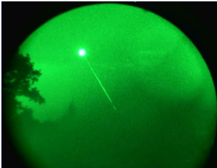
Video frames of aerial light emitting strong beam on October 10, 2009, in Murrysburg, Pennsylvania. Sony HDR-VR500 HD digital camcorder attached to an ATN NVM14-3A Generation 3 Nightvision scope with a 5X zoom lens. Video images © 2009 by Alison Kruse.

And that might have been what made the vapor-type smoke that is wafting past the tree afterwards. I went and looked in the daytime and there are some brown leaves, but nothing that looked curled or burned.