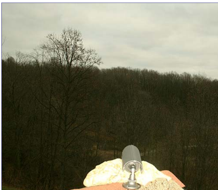
Clover HDC-501 “military grade” IR vari-focus, Color Day/Night 5mm-50mm security camera propped up by blanket on the roof.

Recently, I interviewed Alison about how the aerial light phenomena started back in June 2008, and a dramatic video file she captured on October 10, 2009, of a bright sphere of light emitting a strong beam down into the woods.