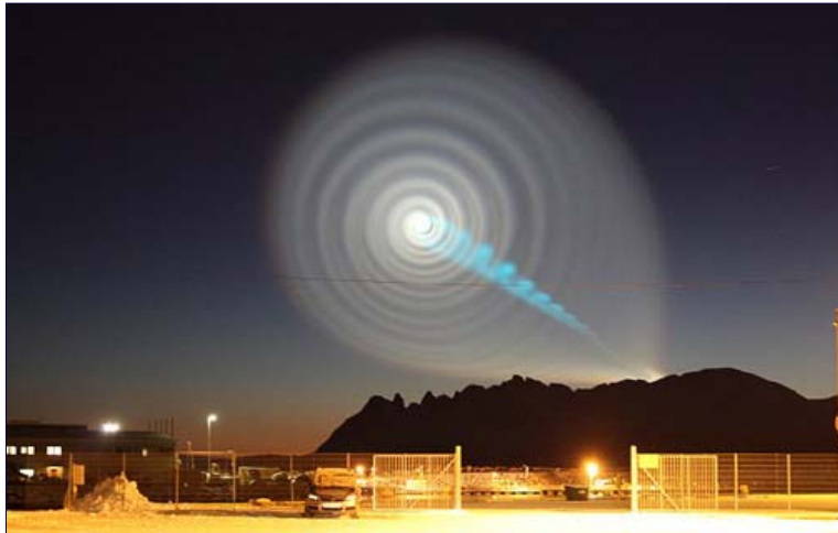
Before sunup on December 9, 2009, residents in northern Norway were photographing, videotaping and describing a baffling aerial phenomenon that some said looked like a giant computer-generated graphic in the early morning sky.

First speculations were that the mysterious spiraling lights might have been a Russian missile test, but Russia denies it was conducting any missile tests in the Norwegian area.