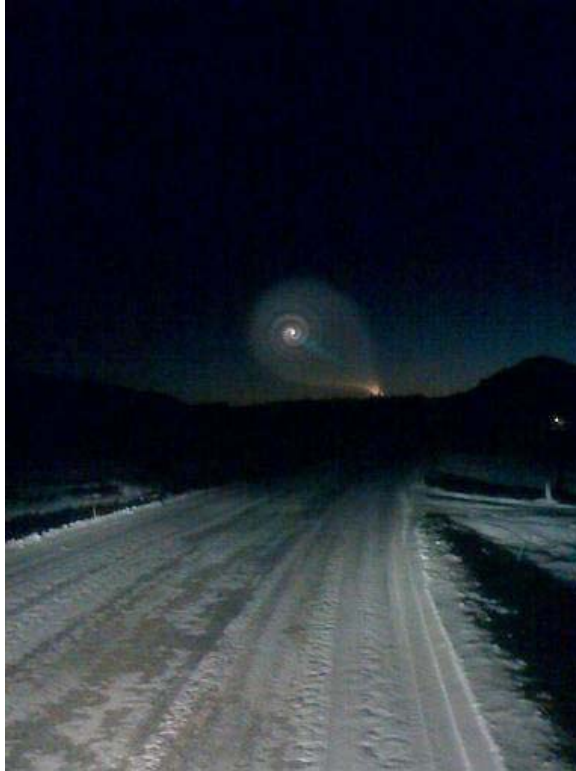
More distant image with snowy road foreground provided by Miles Johnston, Sky TV, London, photographer unknown.