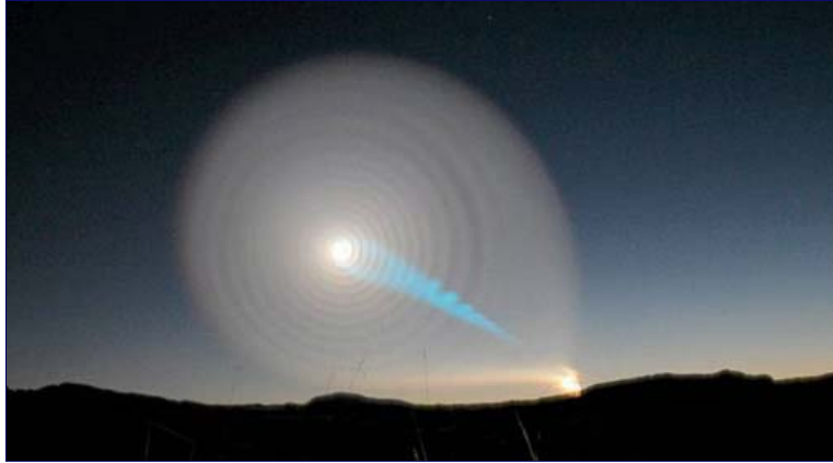
Eyewitnesses said the blue-green spiraling light seemed to “shoot from the center of the white spiraling light” a few seconds after the white rotating light had completed its large sky pattern. Image of unexplained spirals reprinted in Norway's Aftenposten and © 2009 by Dagfinn Rapp.