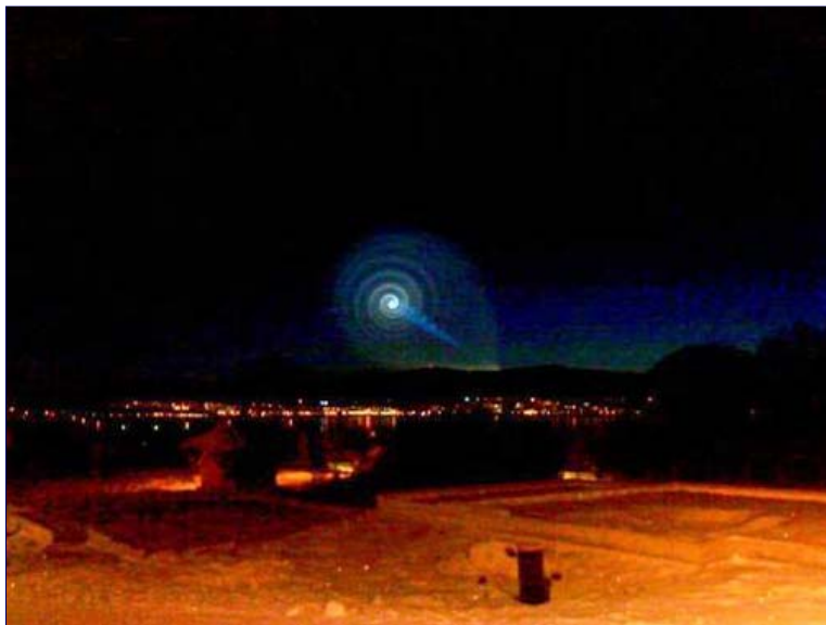
More distant image with snowy road foreground provided by Miles Johnston, Sky TV, London, photographer unknown.