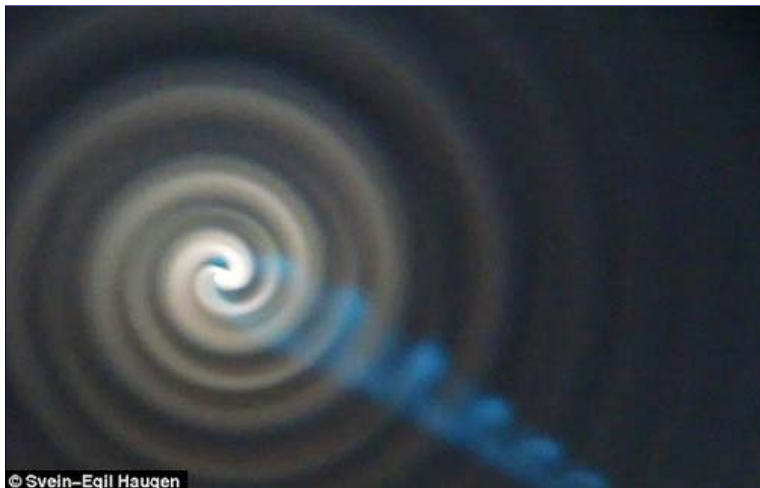
December 9, 2009, early morning close-up of the white spiral after a mysterious light rotated in the sky and from the center of the white spiral came a blue-green spiral. According to some eyewitnesses, the white and blue spirals remained in the sky for ten to twelve minutes before fading out completely.