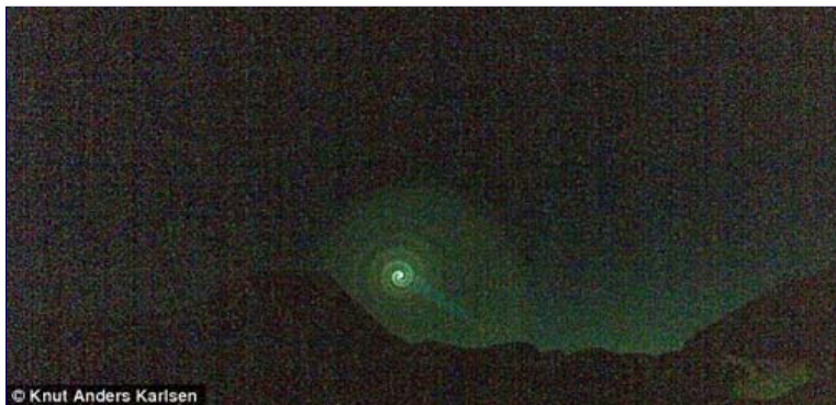
More distant image © 2009 by Knut Anders Karlsen.